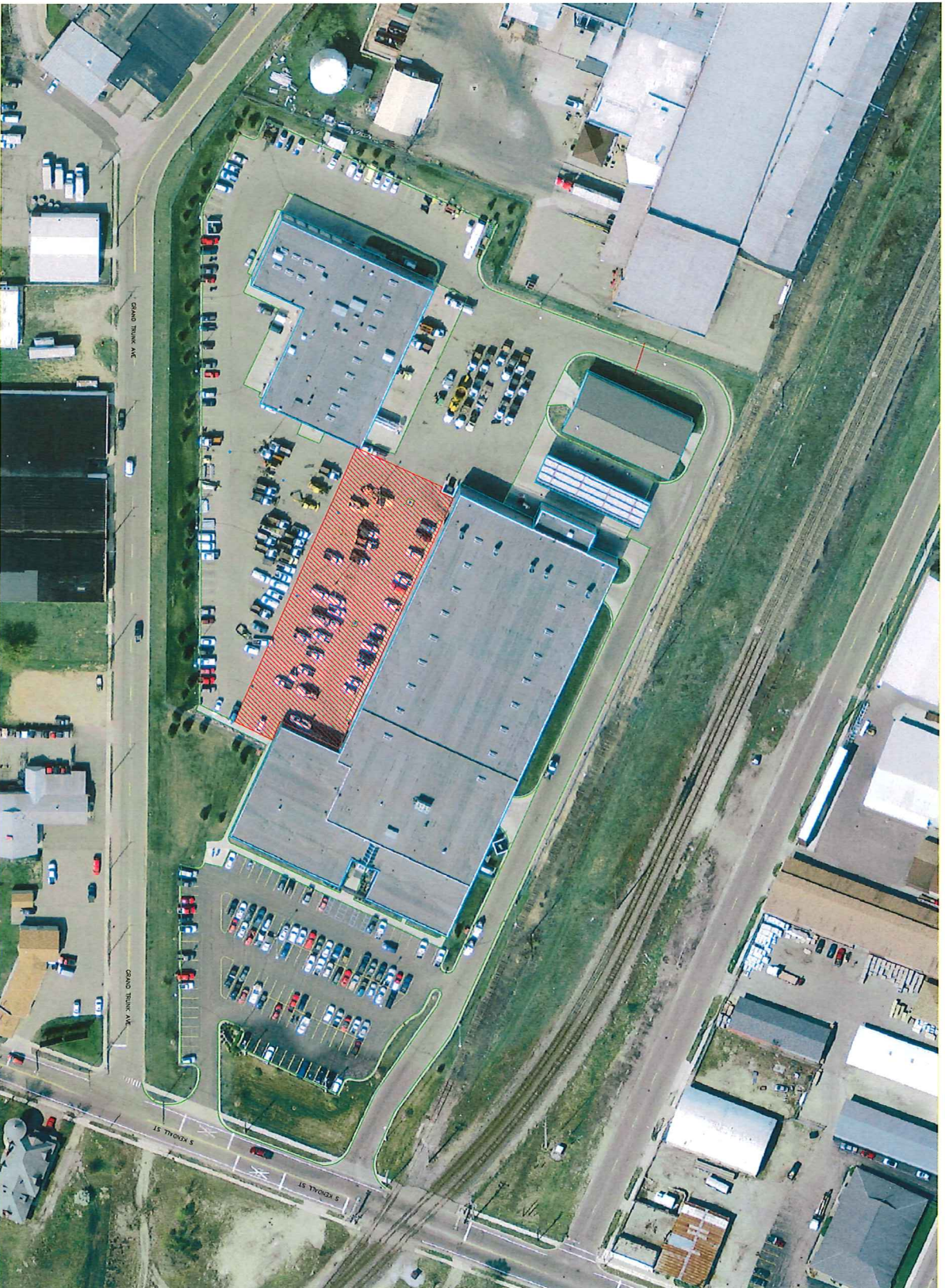
PROPOSED CONSTRUCTION AREA FOR DPW PARKING LOT