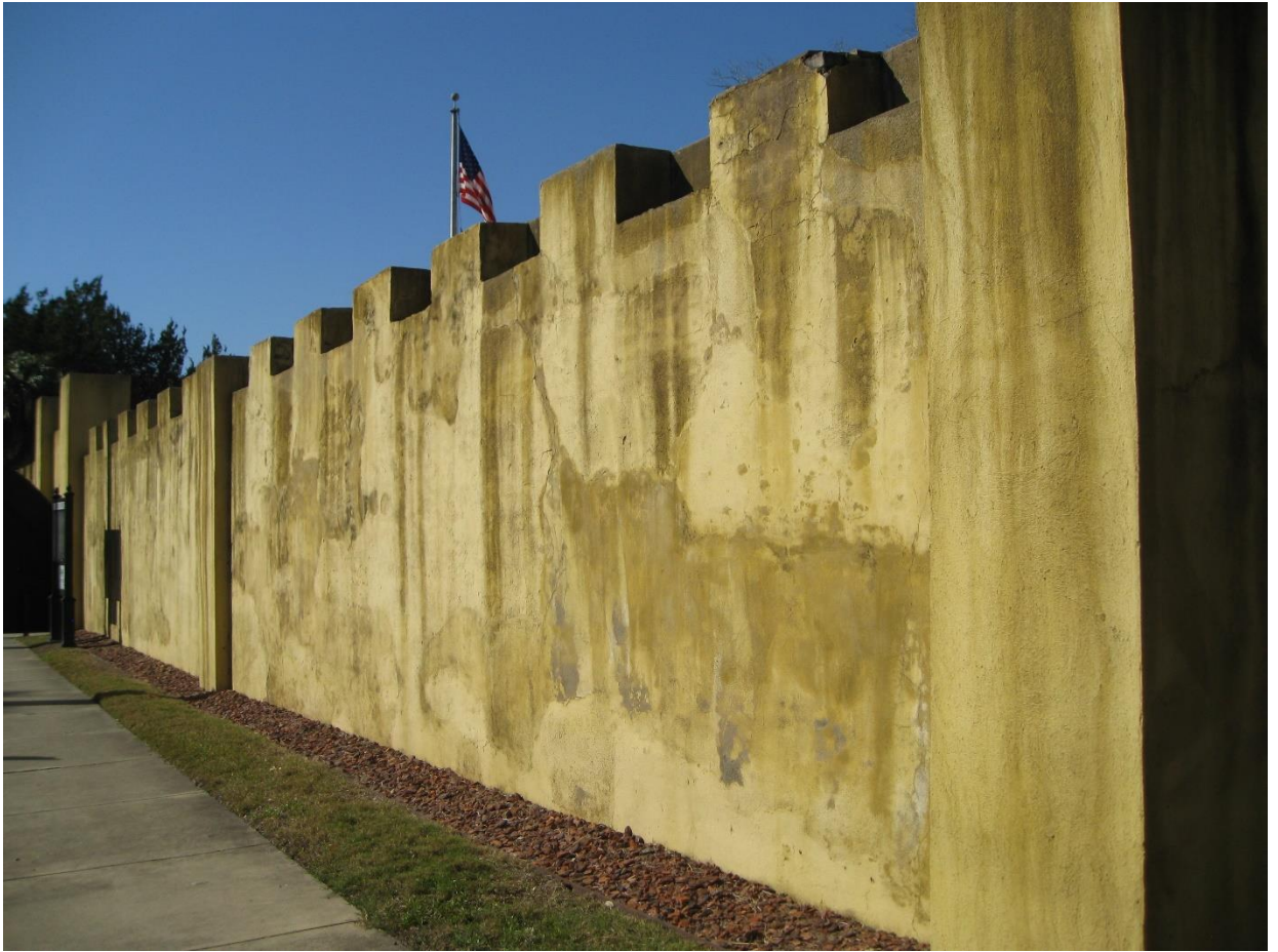
A7. South Outer Wall