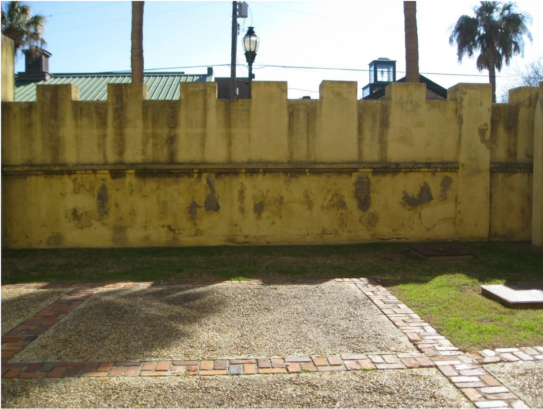
A13. South Inner Wall