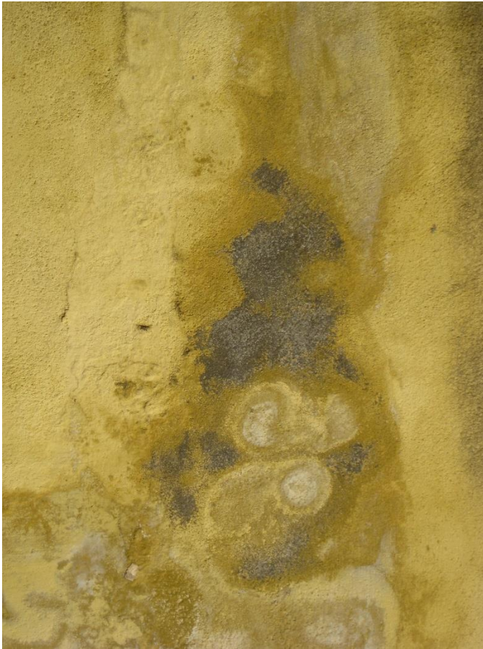
C3. East Outer Wall