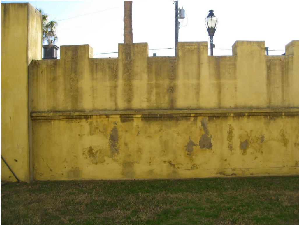
A11. South West Inner Corner