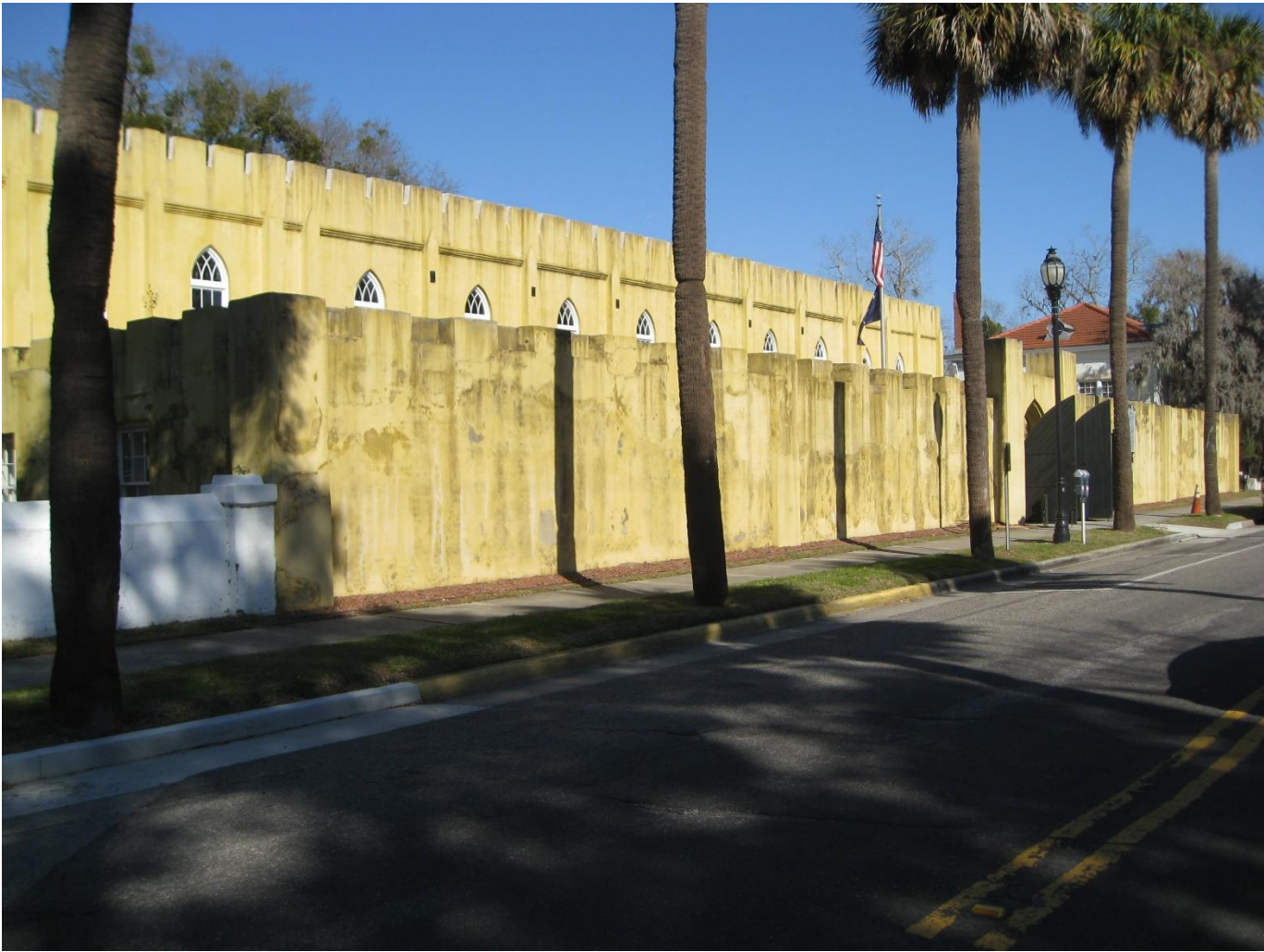
Beaufort Arsenal: South/West Corner