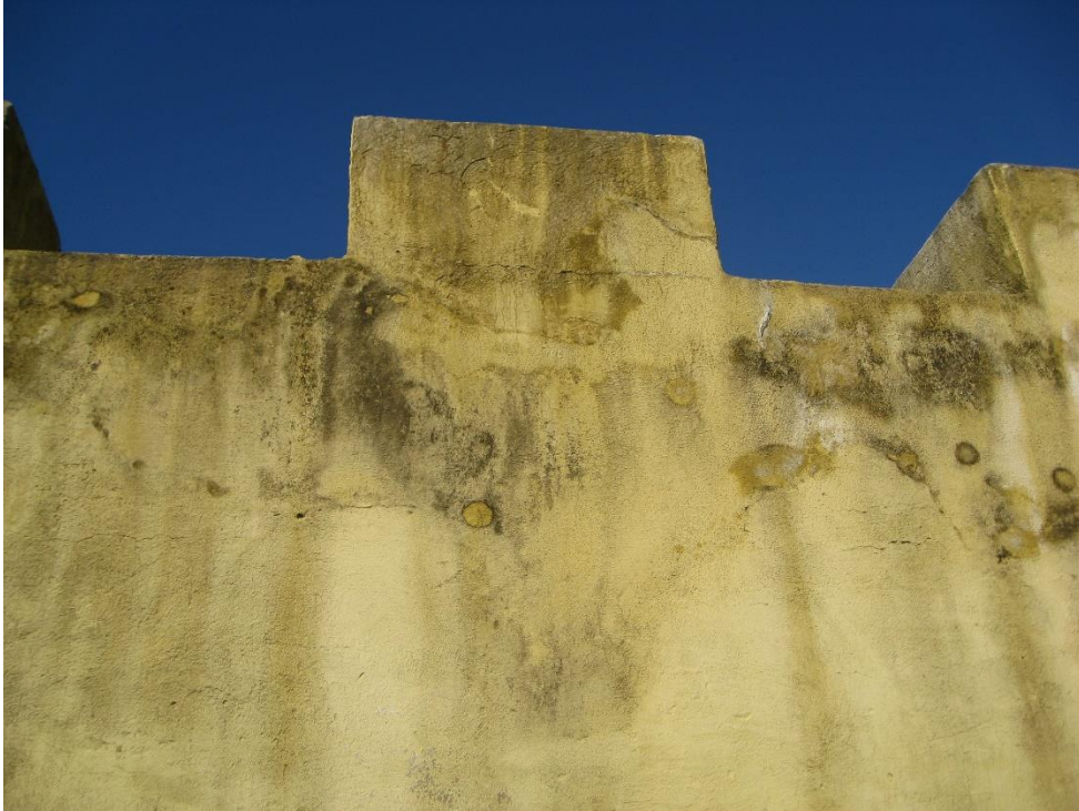
A9. South Outer Wall