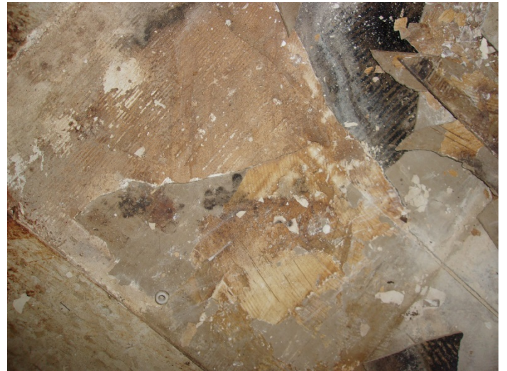
Photo 4 – Typical view of leveling compound with mastics in portions of Building 7 to 35.