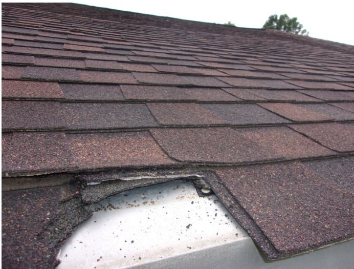
Photo 33 – Typical view of roof shingles and felt on main roofs and awning throughout Building 7 to 35.