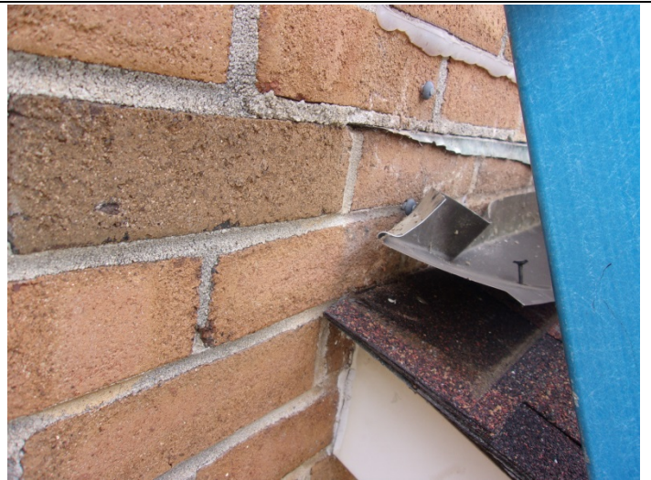
Photo 32 – Typical view of awning/flashing caulk and silicone throughout buildings 7 to 35. Some buildings have no caulk.