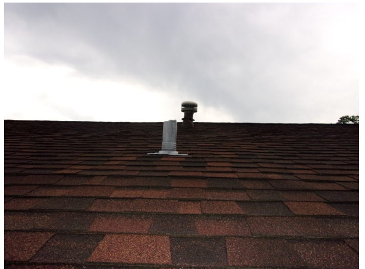
Photo 34 – Typical view of paint coated metal pipe throughout buildings 7 to 35. Some buildings have no metal pipe.