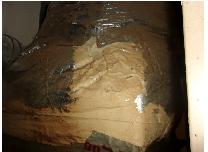
Photo 20 – Typical view beige HVAC mastic in HVAC closets and above drywall ceilings throughout the 1-story duplexes.