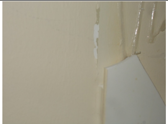
Photo 38 – Typical view of bathroom caulk and silicone on shower stalls throughout Buildings 7 to 35.