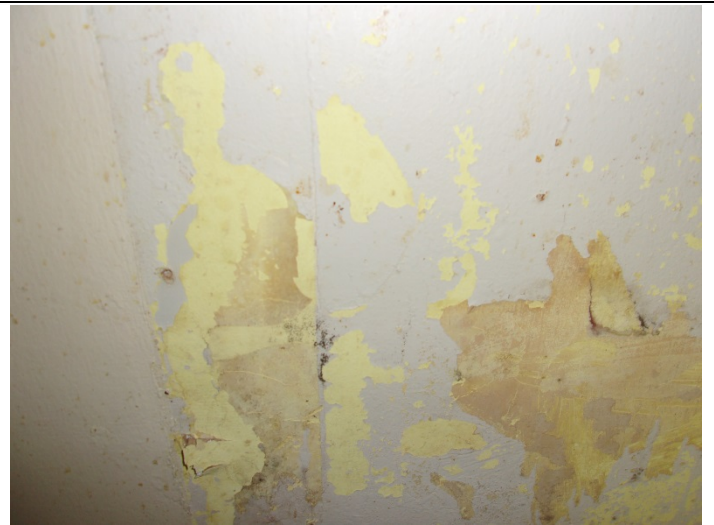
Photo 8 – Typical view of stove back splash mastic in a portion of Buildings 7 to 35.