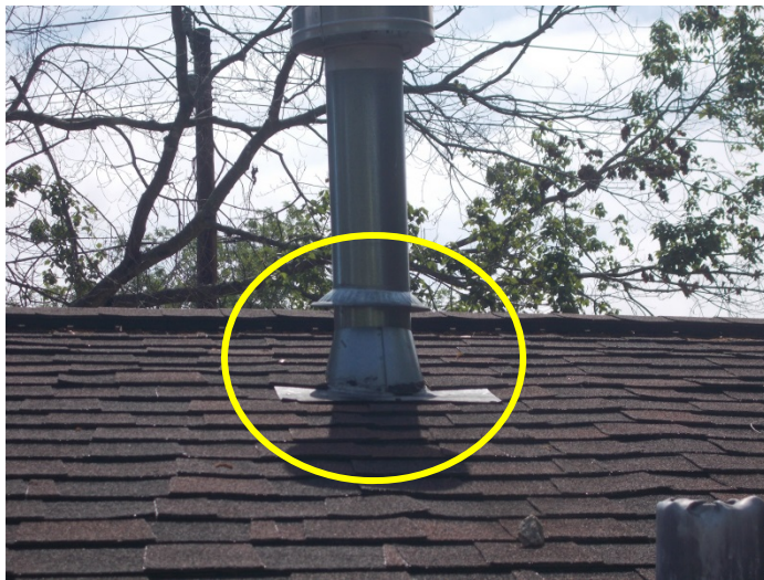
Photo 39 – Typical view of roof mastic/tar on roof penetrations throughout a portion of the buildings.