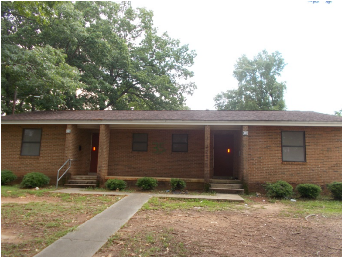
Photo 19 – Typical view of Buildings 9, 10, 11, 32, 33, 34 and 35. 1-story duplexes.