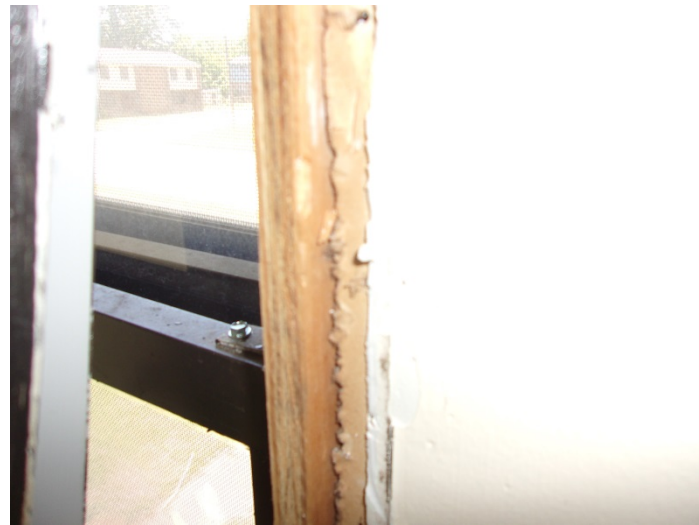
Photo 9 – Typical view of interior white window caulk in a portion of Buildings 7 to 35.