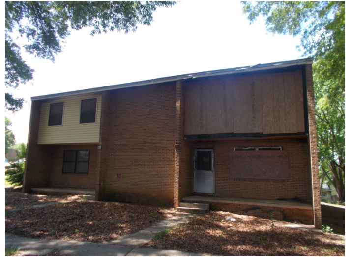
Photo 14 – Building 8, units 521 and 523. Building has fire damage.