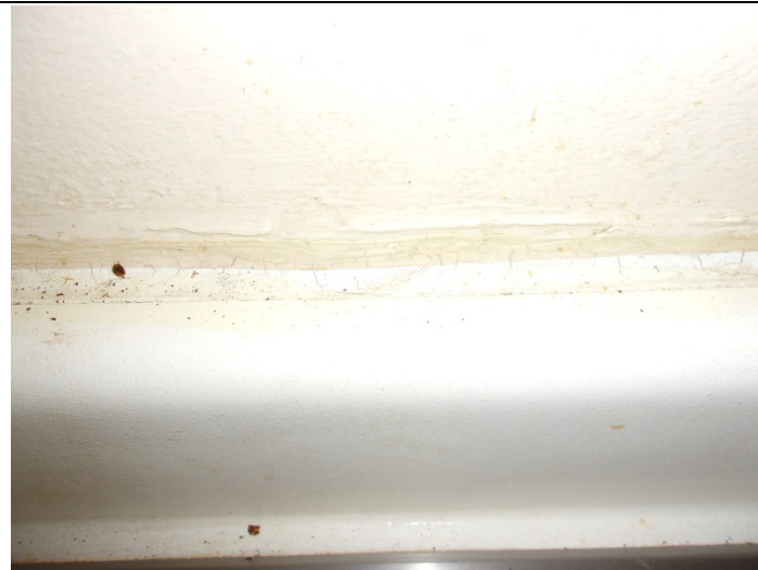
Photo 7 – Typical view of caulk on the kitchen counters throughout buildings 7 to 35.