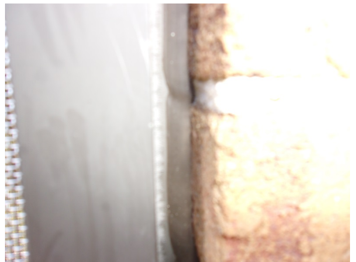
Photo 12 – Typical view of interior and exterior black window caulk throughout buildings 7 to 35.