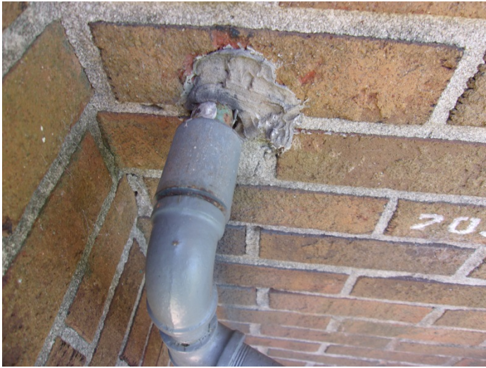
Photo 13 – Typical view of grey wall penetration mastic a portion of Buildings 7 to 35.