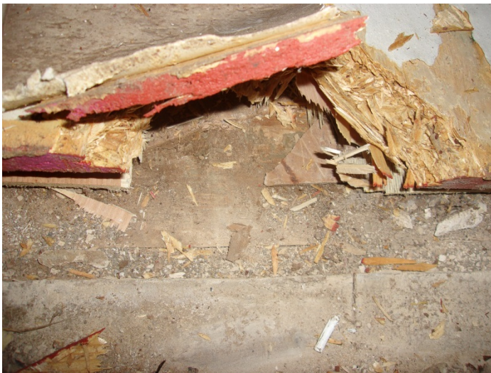
Photo 29 – Typical view of floor tile and mastic under wood on the 2 nd floors of Buildings 7 to 35.