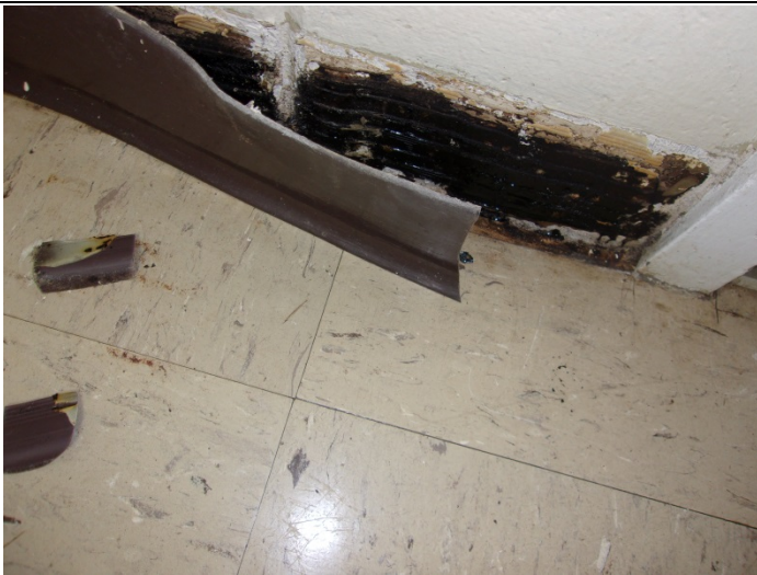
Photo 25 – Typical view of cove base and mastic in a portion of Building 7 to 35.