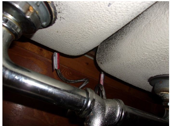
Photo 10 – Typical view of a kitchen sink with white undercoating throughout buildings 7 to 35.