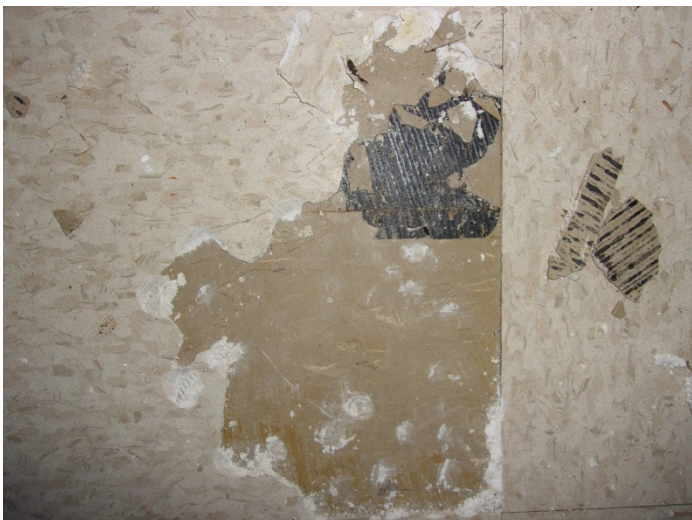
Photo 23 – Typical view of 12"x12" brown streaked floor tile and mastic (bottom layer) assumed positive in Buildings 7 to 35.