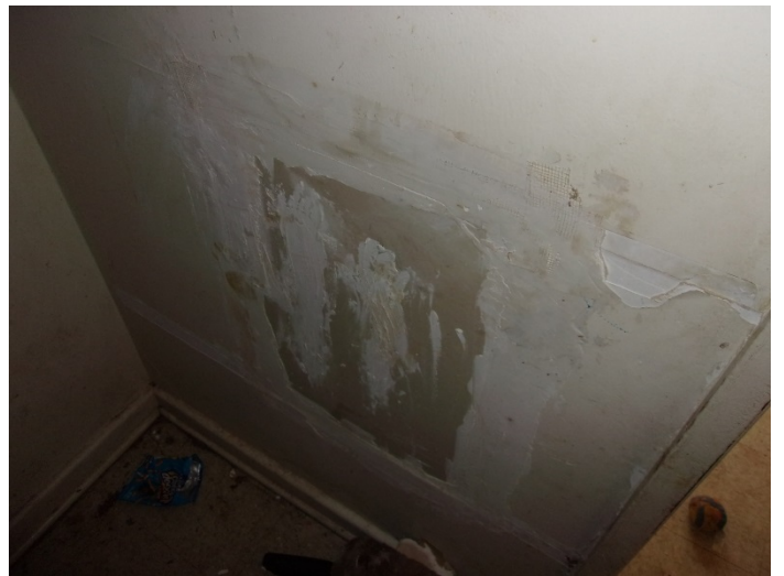
Photo 36 – Typical view drywall patches throughout buildings 7 to 35. Buildings exist with no patches.