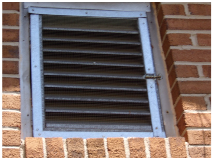
Photo 22 – Typical view of caulks on roof gable vents throughout Buildings 7 to 35.