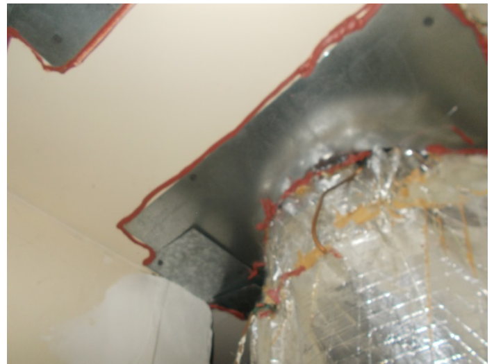
Photo 40 – Typical picture of red HVAC caulk in the HVCA closets throughout Buildings 7 to 35.