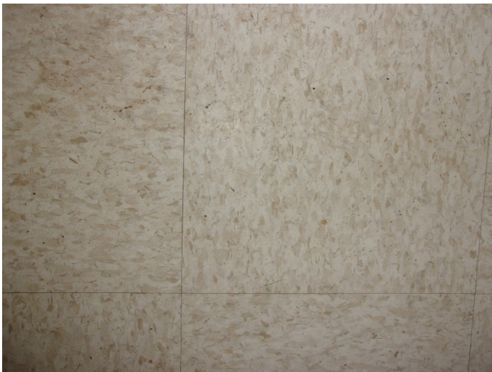
Photo 5 – Typical view of the top layer of 12''x12'' tan speckled floor tile and mastic/adhesive throughout buildings 7 to 35.