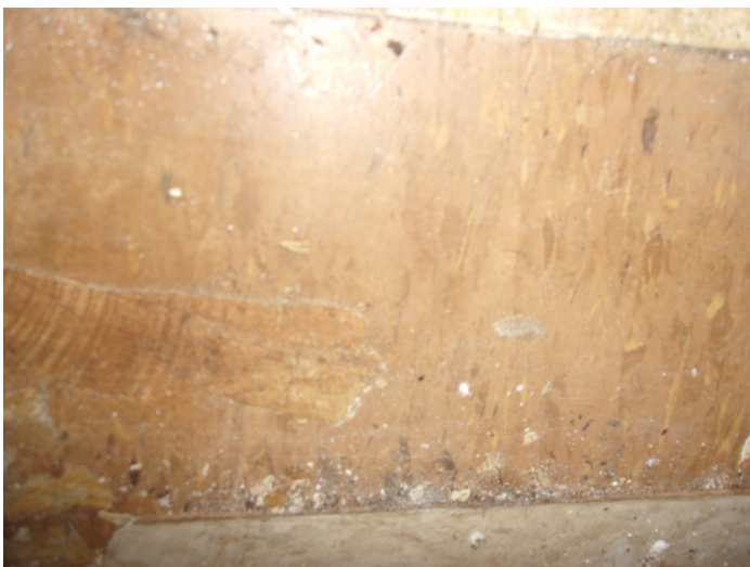
Photo 21 – Typical view of 12"x12" brown/orange floor tile and mastic (bottom layer) throughout buildings 7 to 35.