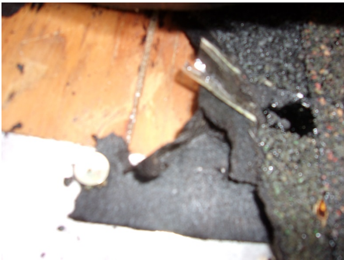
Photo 35 – Typical view of additional layers of felt on awning roofs throughout a portion of buildings 7 to 35.