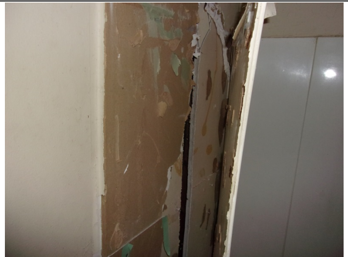
Photo 26 – Typical view of shower stall mastic in portions of Buildings 7 to 35.