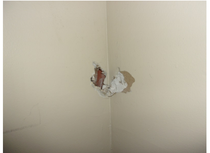
Photo 2 – Typical view of drywall with joint compound and tape throughout buildings 7 to 35.