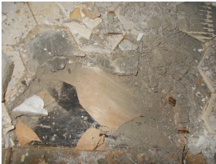
Photo 41 – Typical view floor tile and mastic under ceramic tiles in bathrooms throughout Buildings 7 to 35.