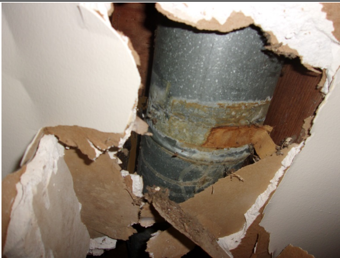
Photo 31 – Typical view of HVAC tape on HVAC ducts throughout Buildings 8 and 12 to 35.