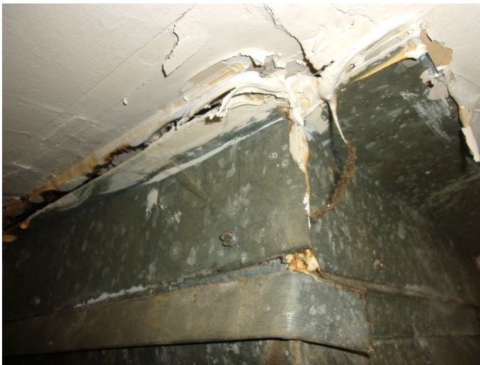
Photo 27 – Typical view of HVAC caulk in the HVAC closets throughout Buildings 7 to 35.