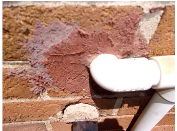
Photo 30 – Typical view of red cementitious filler on exterior wall penetrations on portions of Buildings 7 to 35.