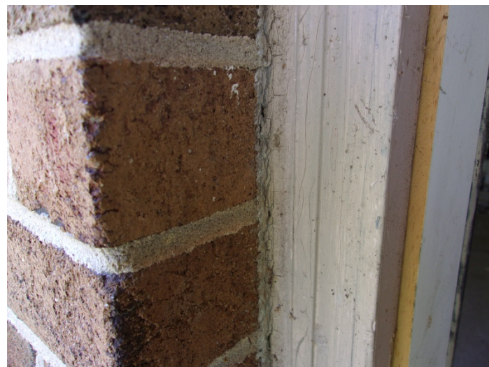
Photo 11 – Typical view of exterior grey door caulk throughout buildings 7 to 35.