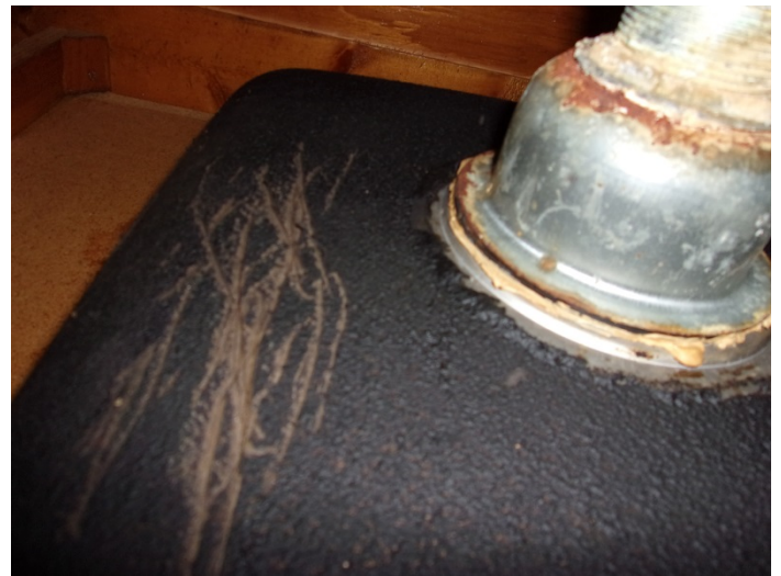
Photo 28 – Typical view of kitchen sink with black undercoating throughout Buildings 7 to 35.