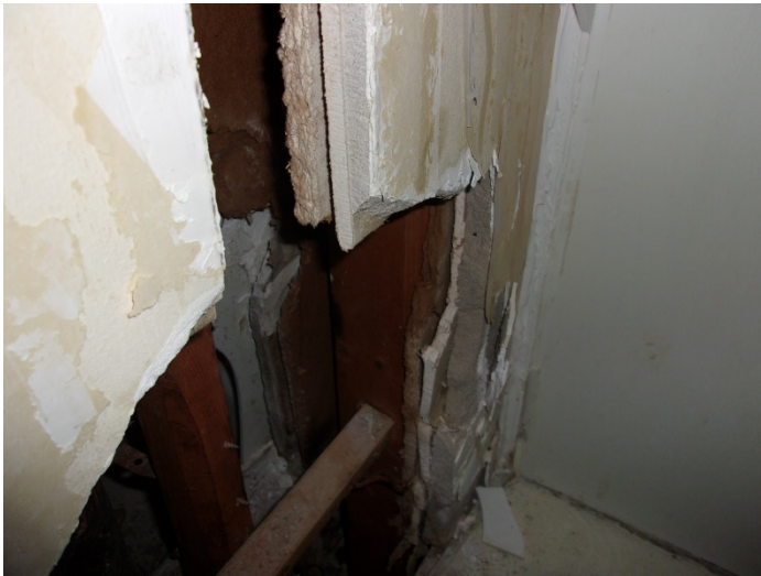
Photo 3 – Typical view of plaster with finish over unfinished drywall in the bathrooms of buildings 7 to 35.