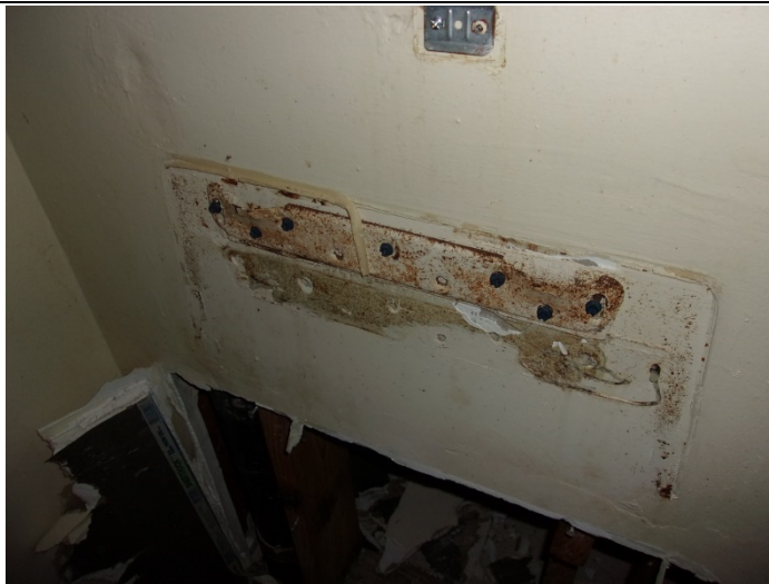
Photo 37 – Typical view of bathroom caulk on sinks throughout Buildings 7 to 35.