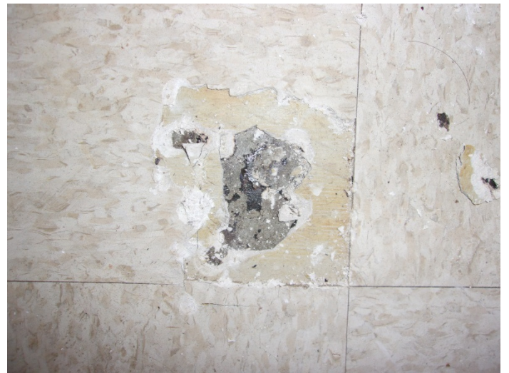
Photo 6 – Typical view of the 2 nd layer of floor tiles in over concrete in the 1 st floors of Building 7 to 35.