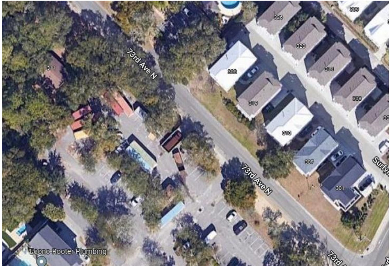
Exhibit B – Aerial Photos 73rd Avenue North