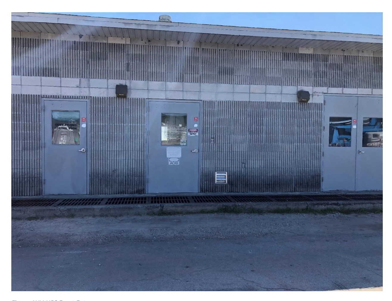
Figure 1UV-UPS Front Entrance