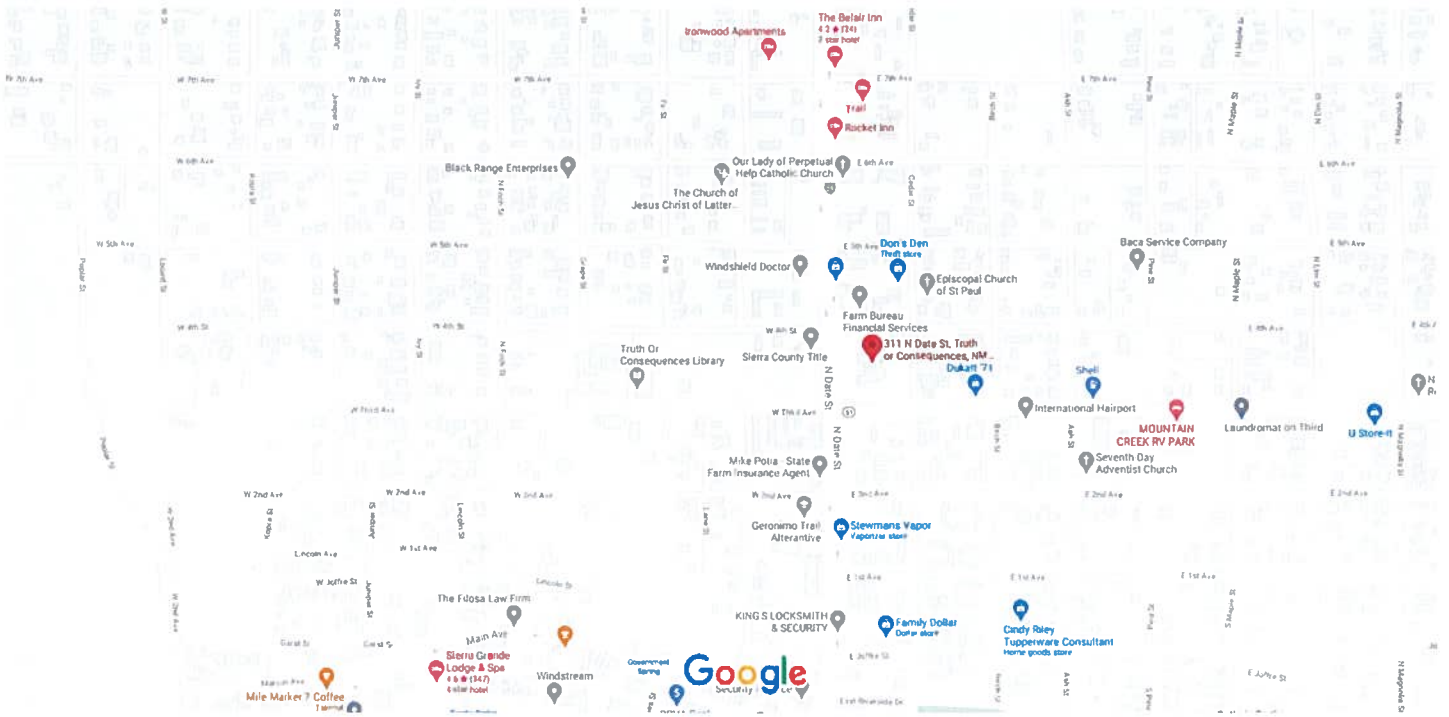
200 ft