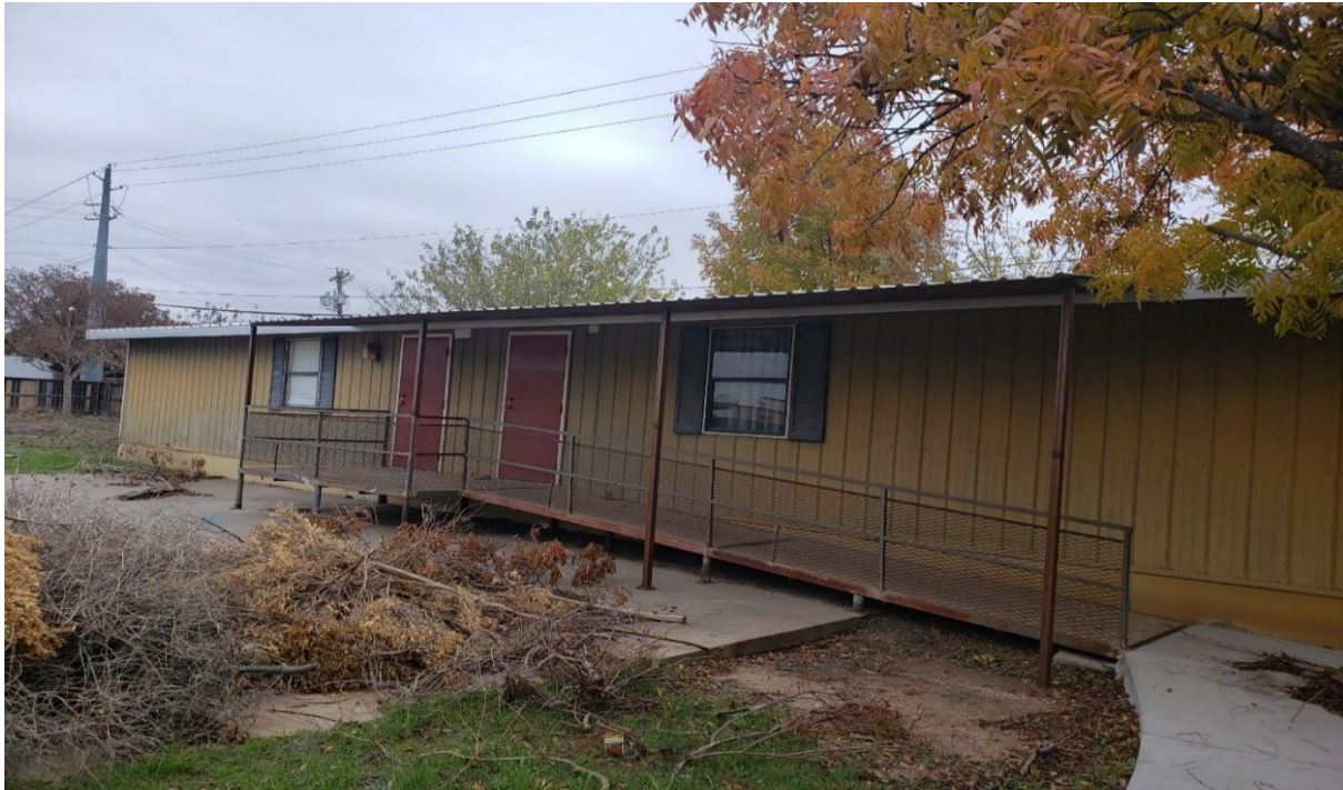
Building size:28' x 60' with two (2) interior rooms.

B. The Contractor shall prime, minimum one coat, and paint, minimum 2 coats, the interior of the bldg. Interior paint shall be urethane enamel in an eggshell finish. Interior wall color: Sherwin-Williams Duration SW-6119 Antique White or approved equal. Interior Trim Paint: SW7005 Pure White. Product and color chart submittal required.