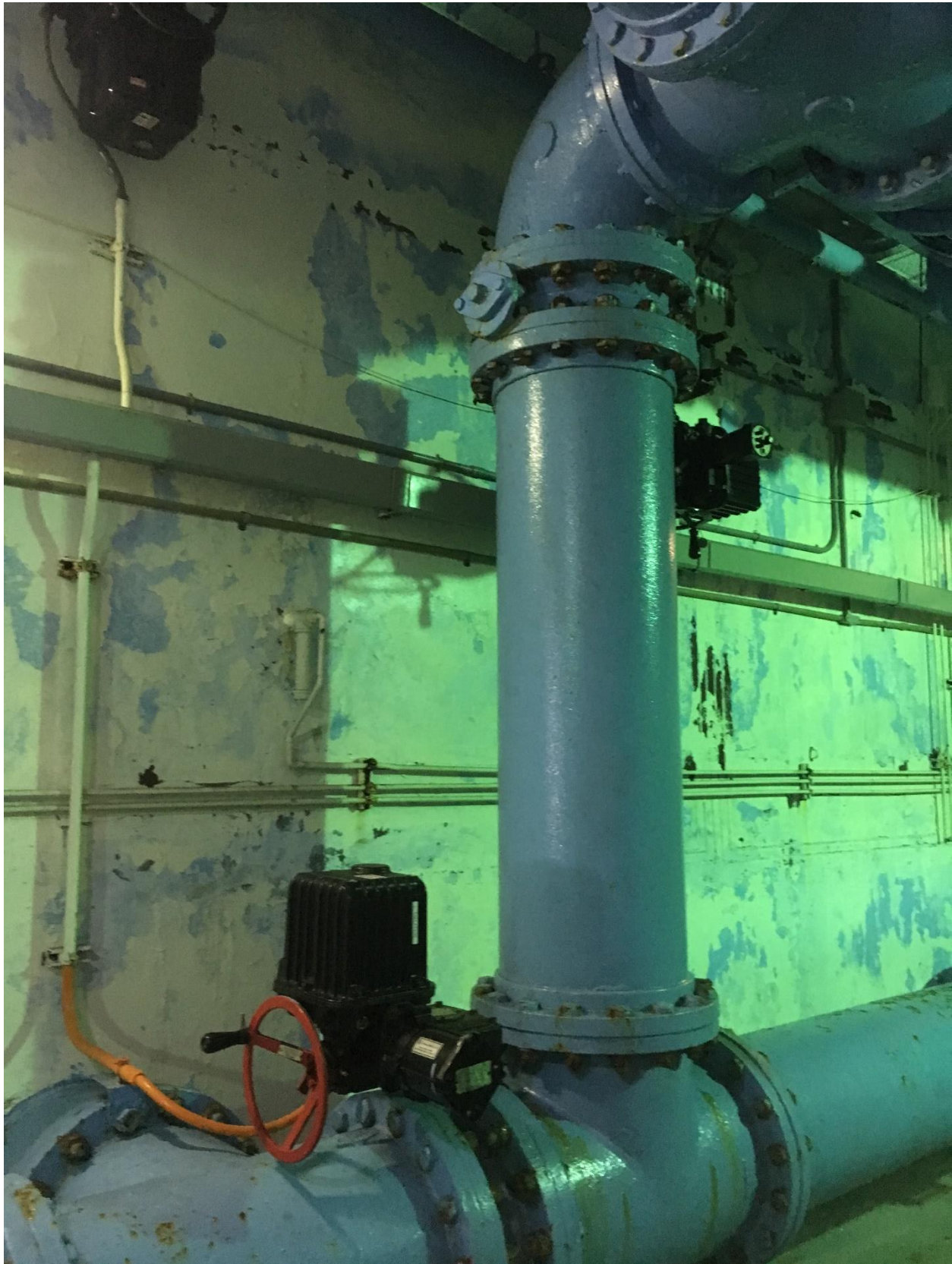
Close-up of Filter Piping and Valves