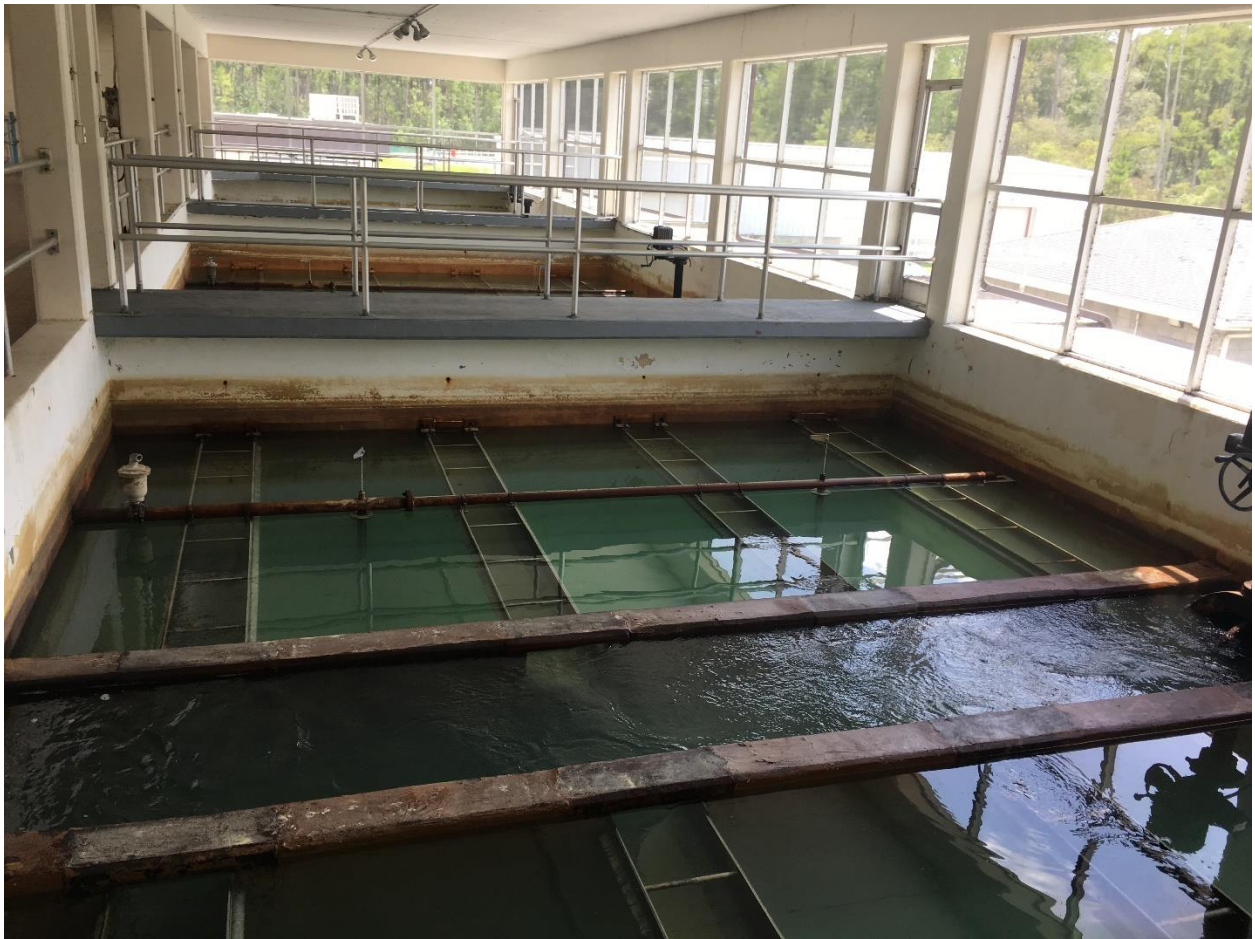
Existing Filter Cells 1, 2 and 3