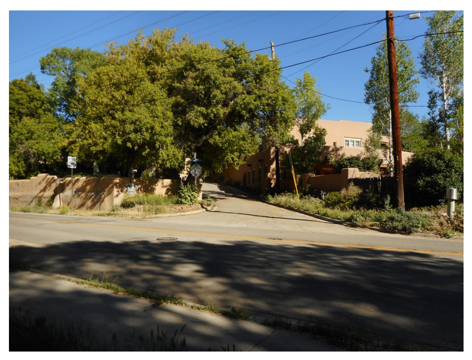
B. Facing North