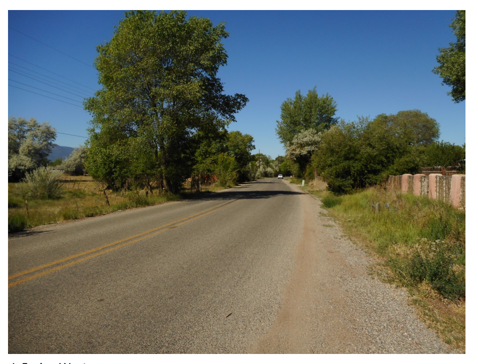
I. Facing West