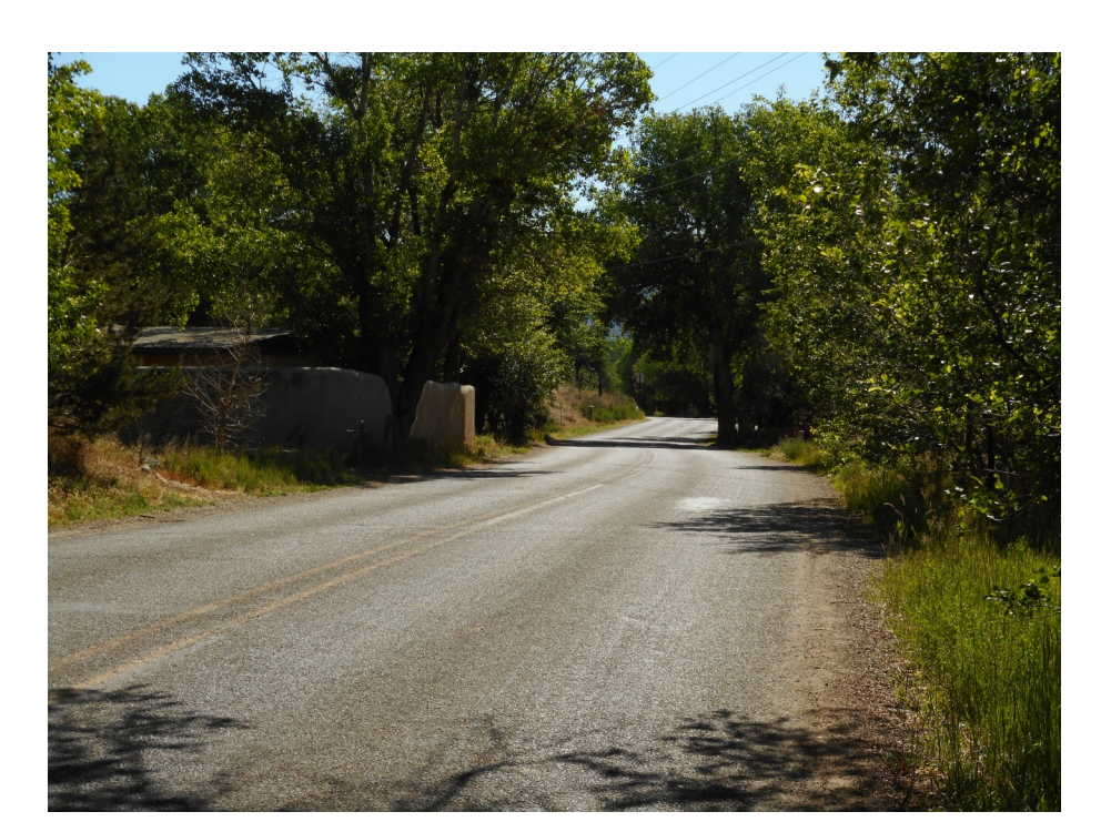
G. Facing East