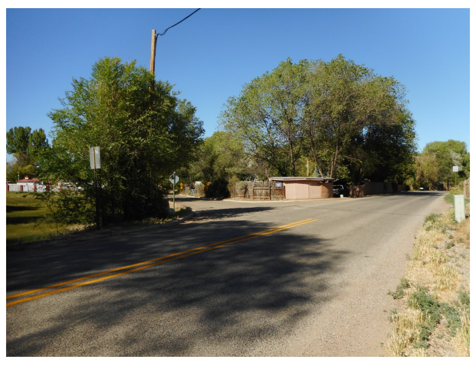
E. Facing West