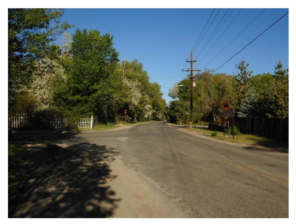
L. Facing West