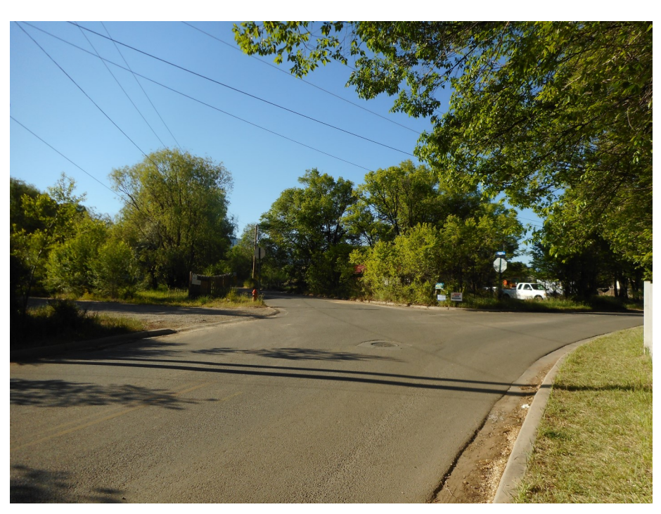
N. Facing South