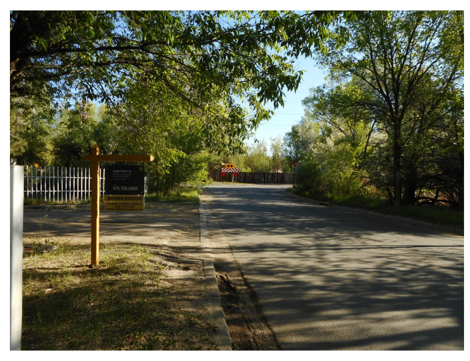
M. Facing North