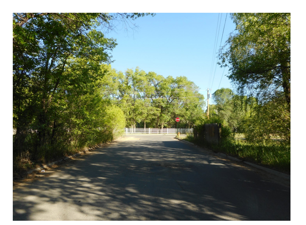
O. Facing South