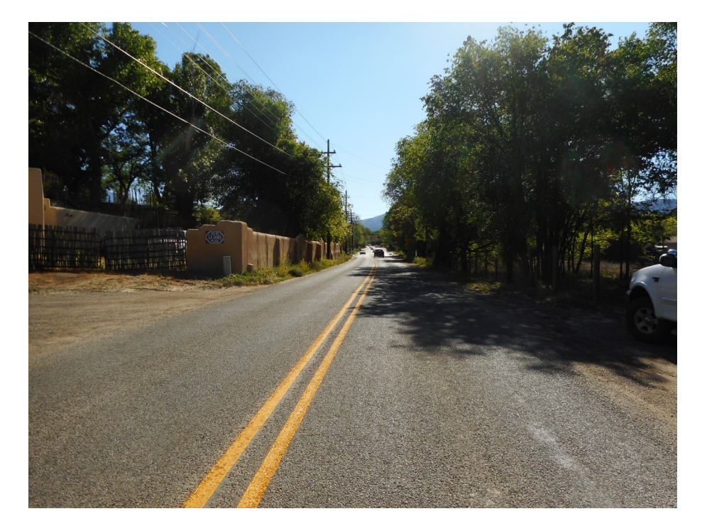
C. Facing East