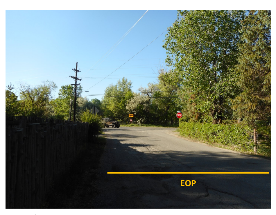
R. End of Project on Carabajal Road- Facing South