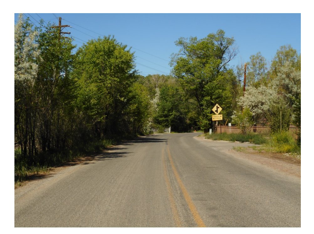
K. Facing West