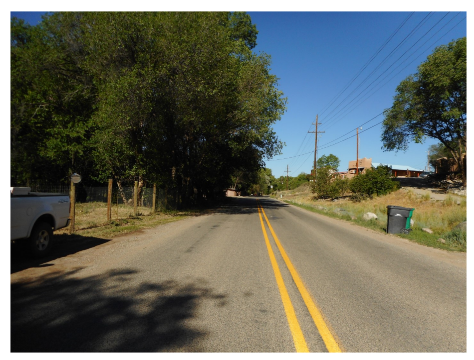
D. Facing West