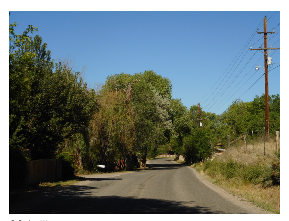
F. Facing West