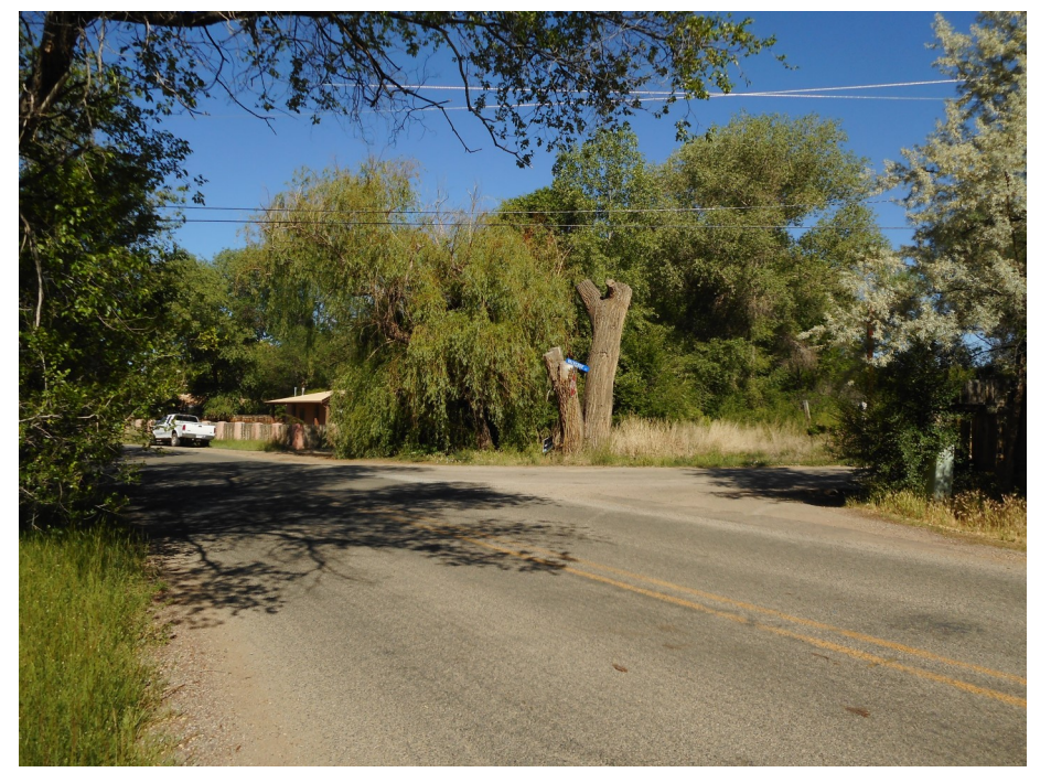
H. Facing West