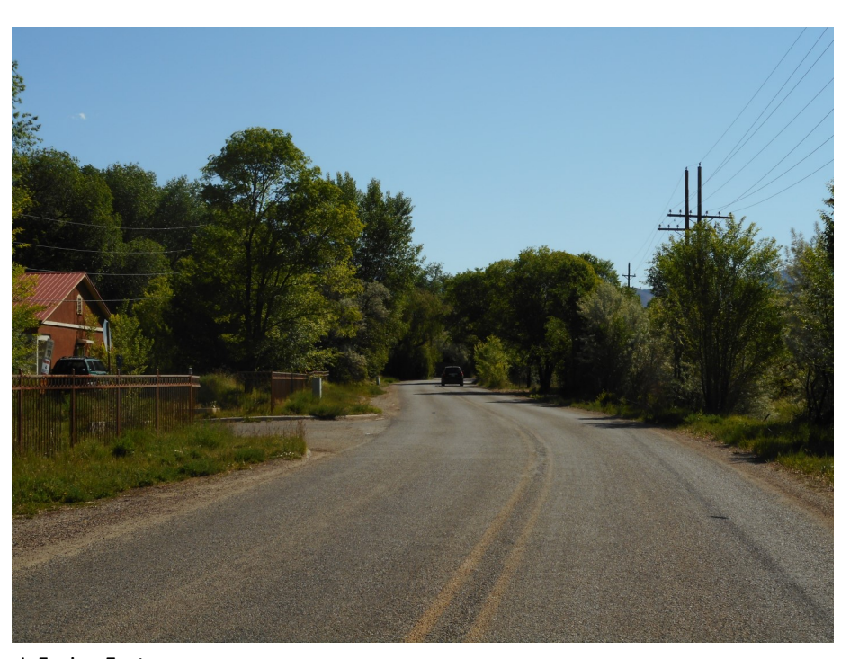
J. Facing East