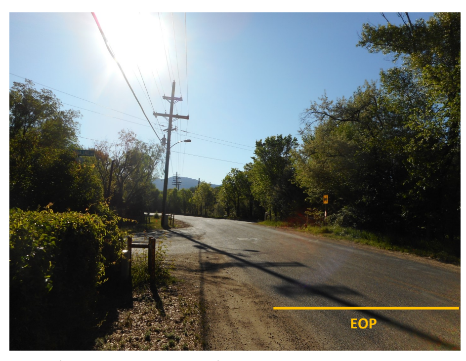
Q. End of Project on Ranchitos Road - facing West