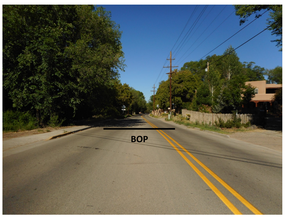
A. Beginning of Project - facing West