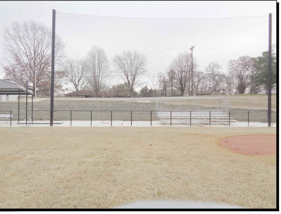
1 → BLEACHERS ON CONCRETE