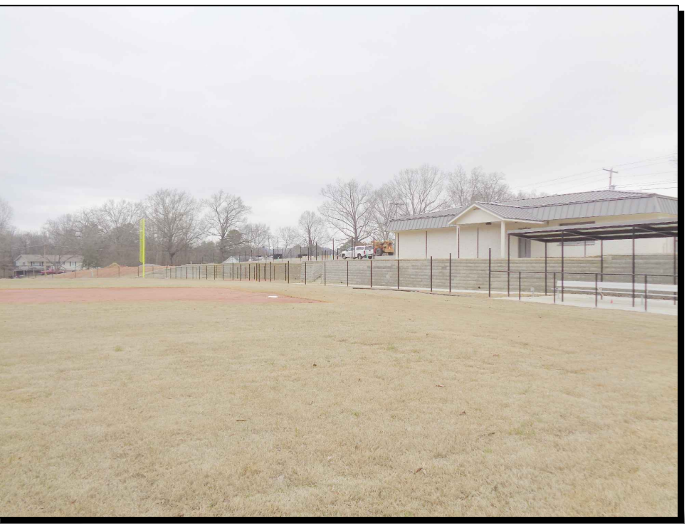
2 → BUILDING LOCATION