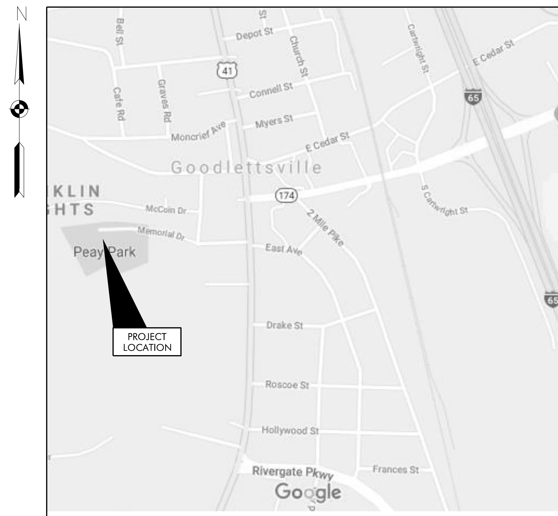
VICINITY MAP SCALE: NONE

200 MEMORIAL DRIVE GOODLETTSVILLE, DAVIDSON COUNTY, TENNESSEE