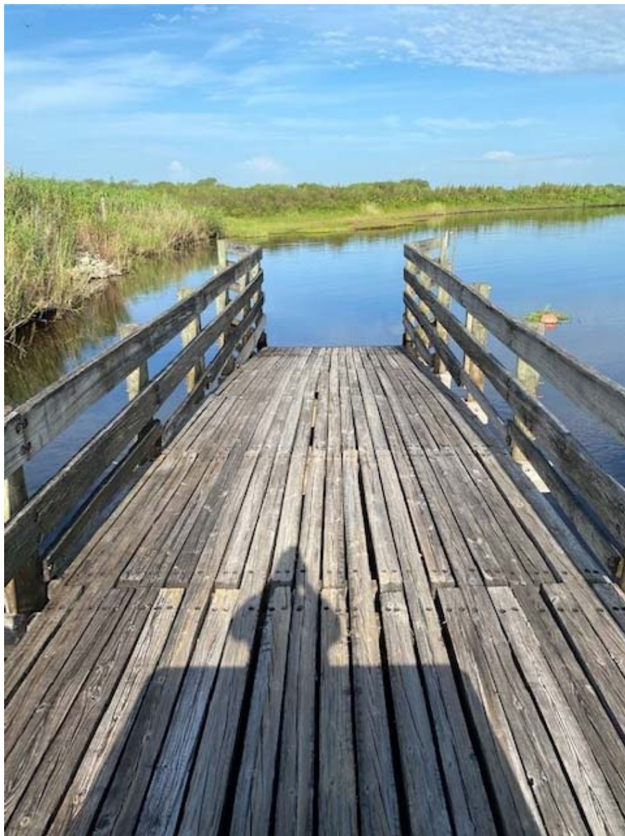
Looking east (upstream)