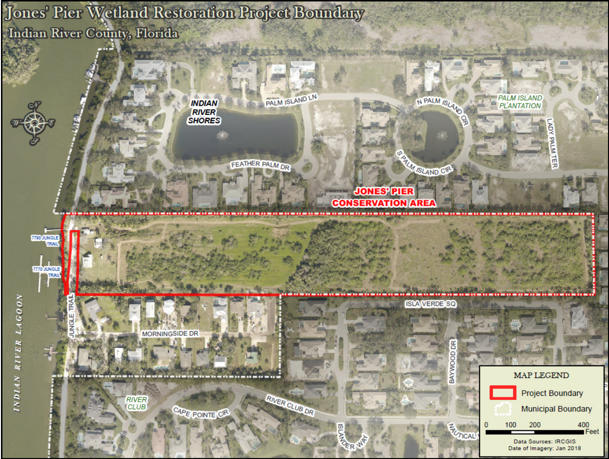
Location of Jones' Pier Conservation Area Along Jungle Trail