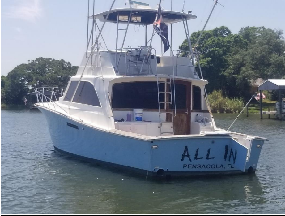
Vessel prior to sinking