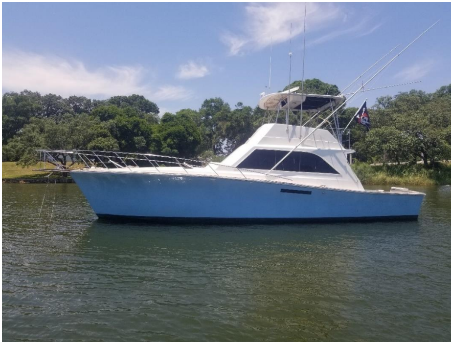
Vessel prior to sinking