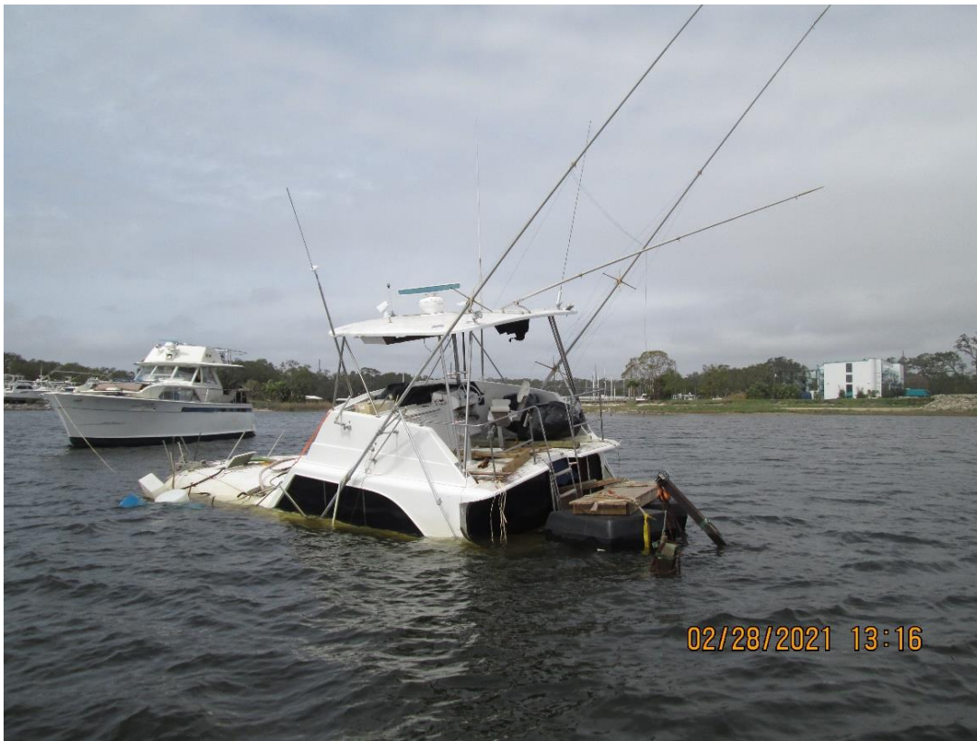
Sunken vessel in foreground