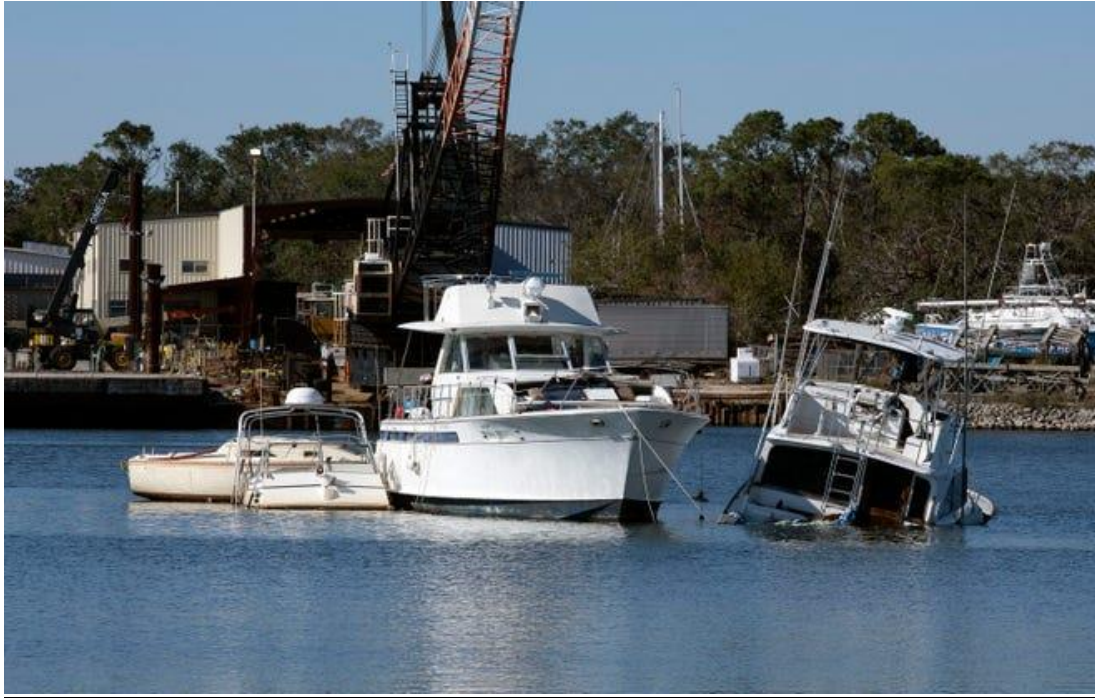
ALL IN – sunken vessel on the right