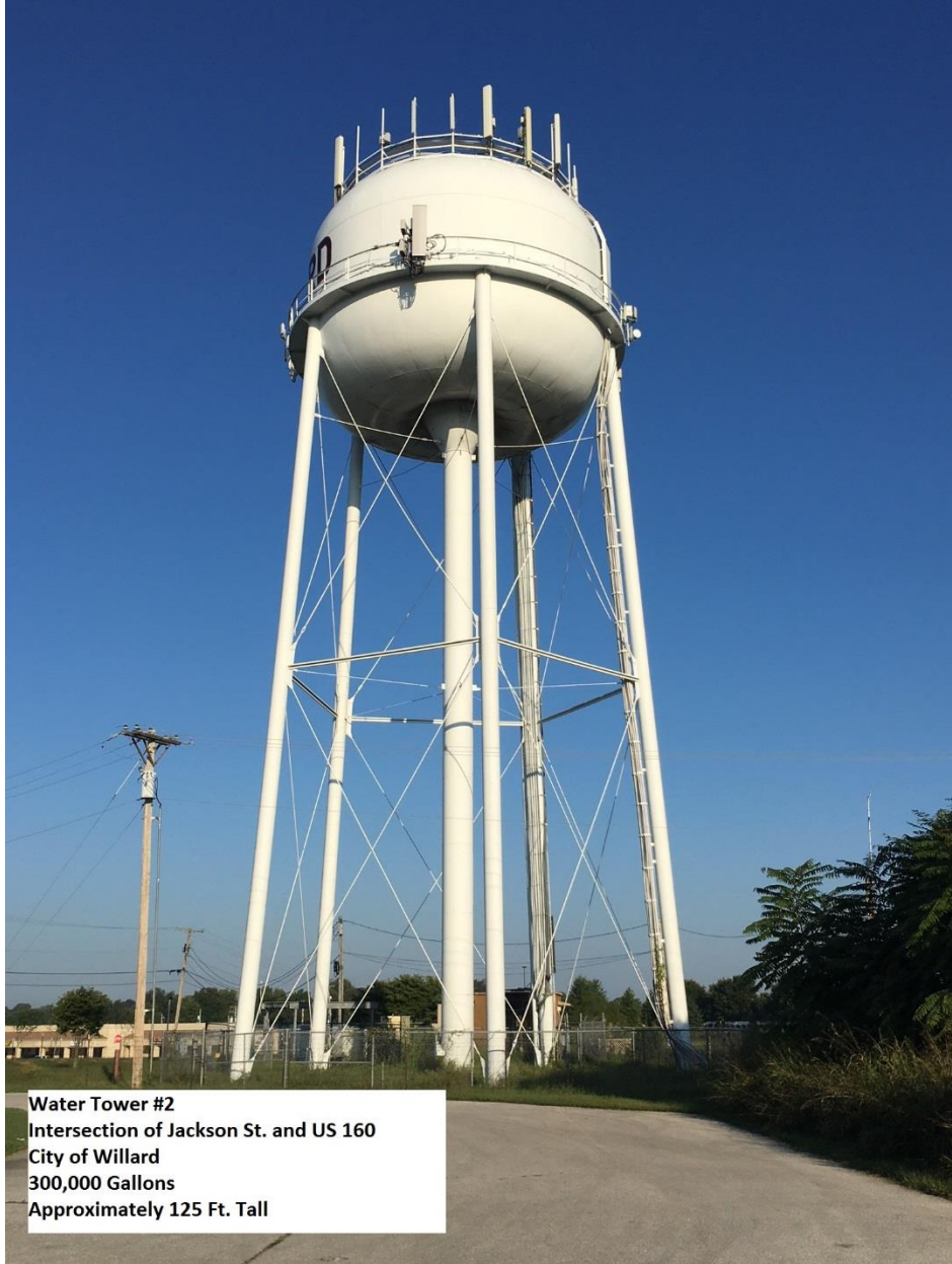
Water Tower #2 Intersection of Jackson St. and US 160 City of Willard 300,000 Gallons Approximately 125 Ft. Tall