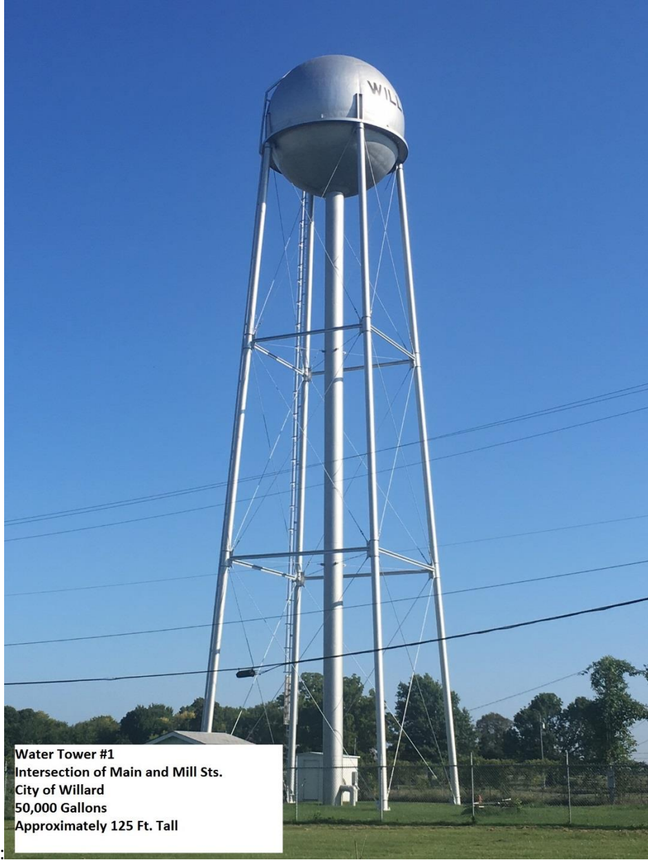
Water Tower #1 Intersection of Main and Mill Sts. City of Willard 50,000 Gallons Approximately 125 Ft. Tall