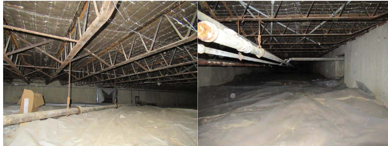
Image 4: View from rear crawlspace entrance and middle crawlspace area at Johnson School/STEM Academy.