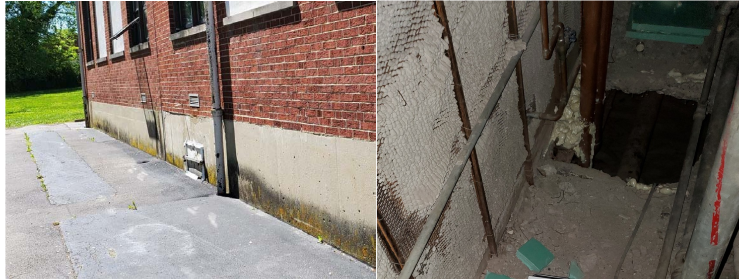
Image 2: Rear (eastern) entrance and internal pipe chase entrance at Johnson School/STEM Academy.