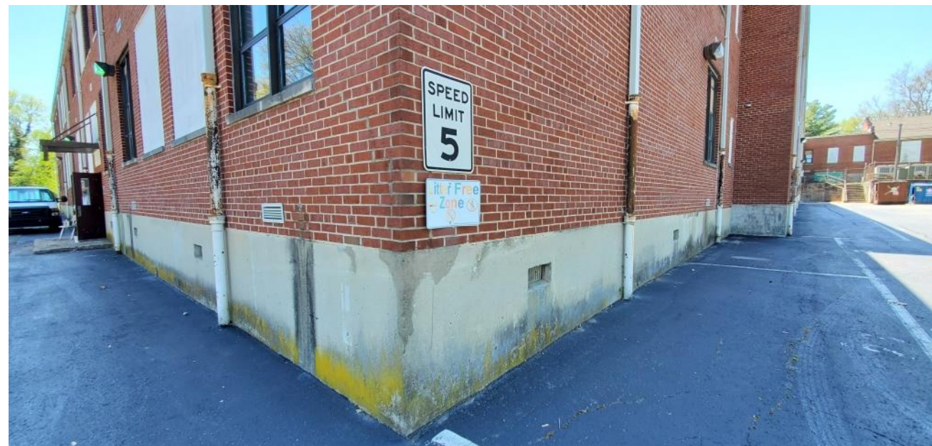
Image 3: Rear (northeastern) corner view of Johnson School/STEM Academy.