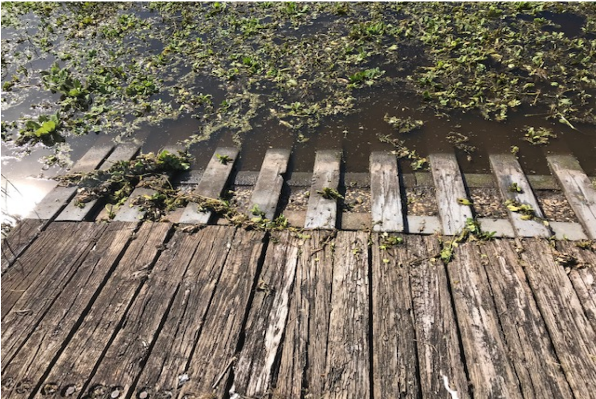
Looking east at water line