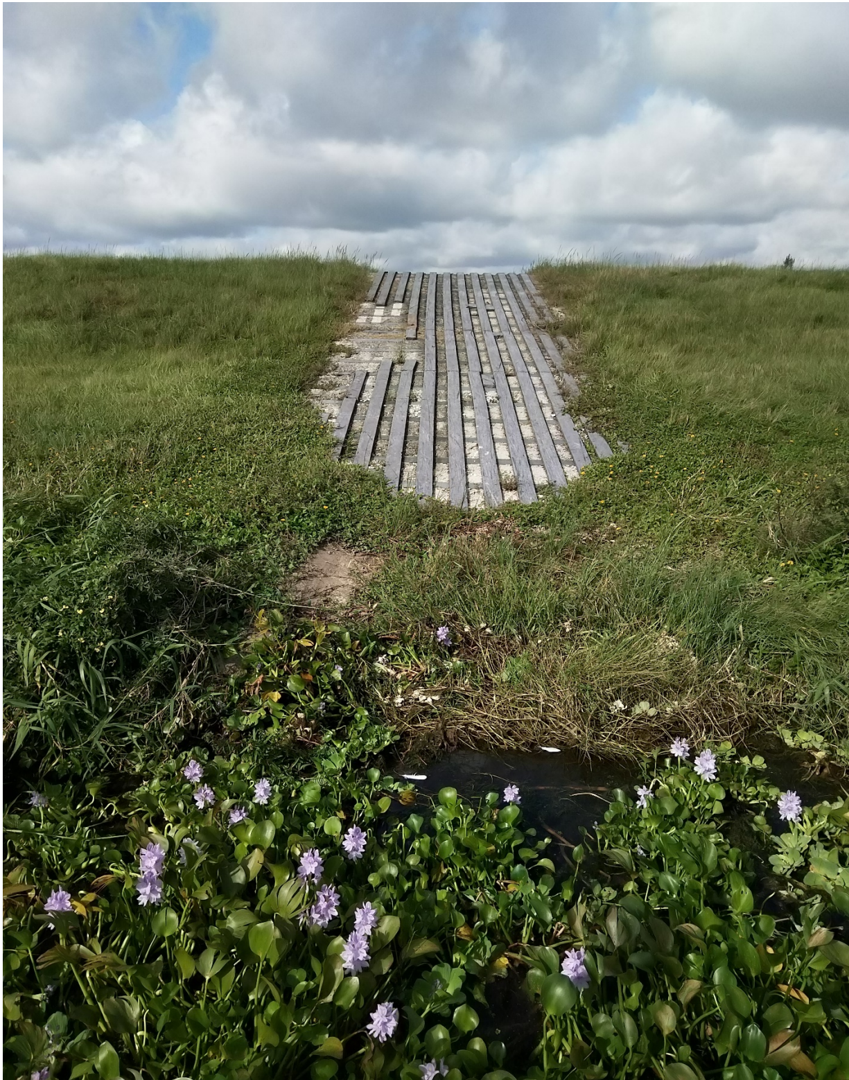
Looking west up the east slope