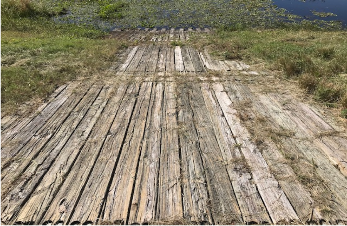
Looking east down slope