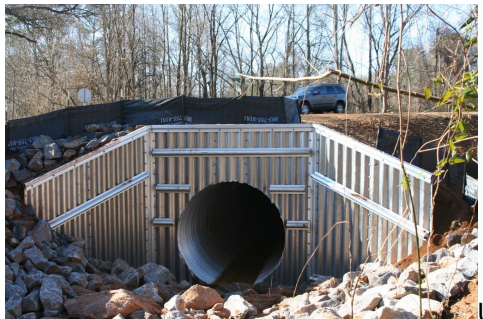
Use Pipe Wingwall