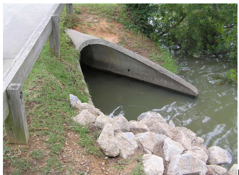
Use Pipe Flared End Section when specified in the plans

Use Pipe End Structure (719-615-00) when specified in the plans or special provisions. Use pipe end structure in locations where pipe exposed end faces the direction of traffic. Pipe end structures may be used in other locations if approved by the RCE.