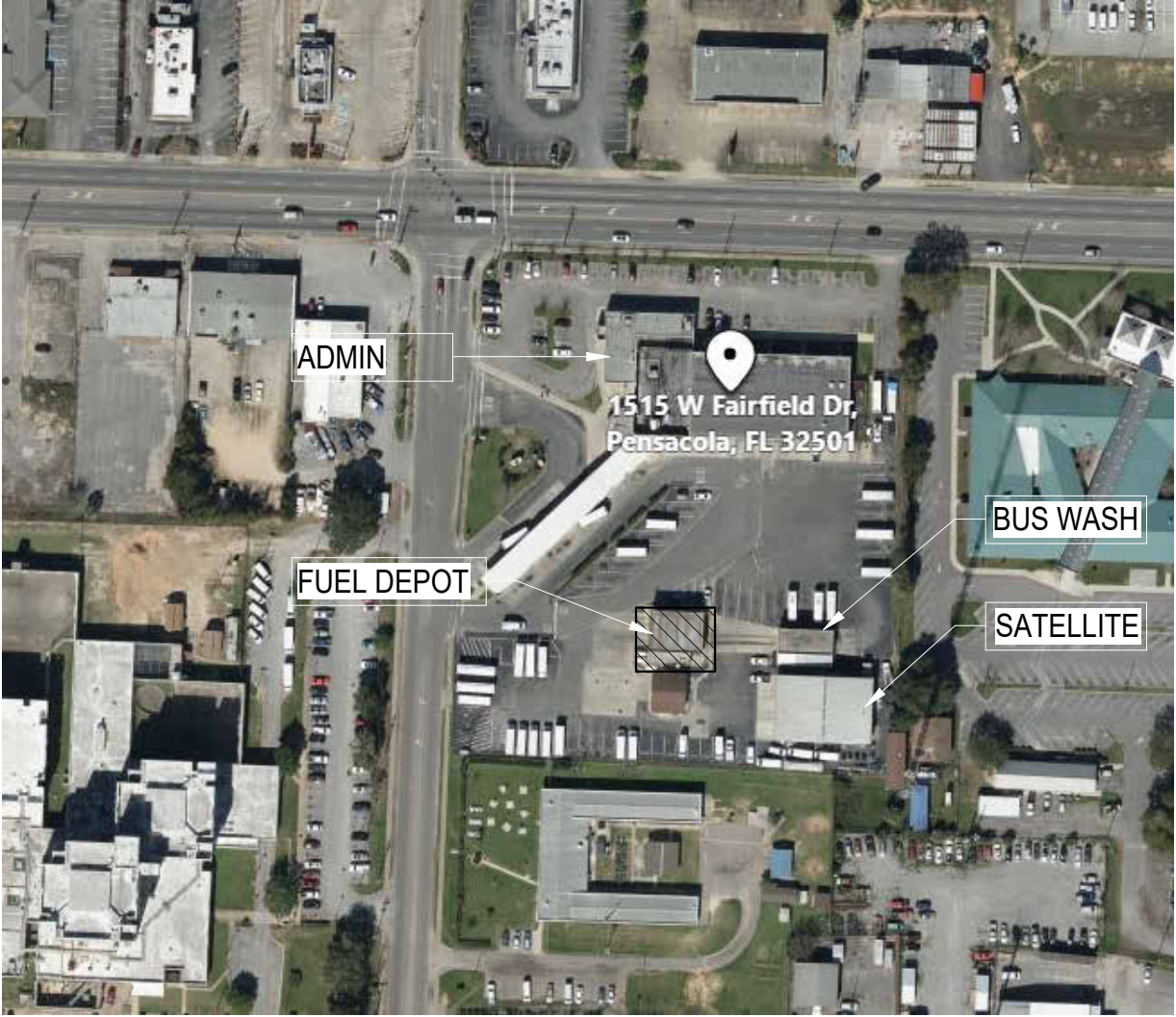
1 VICINITY MAP G001 NOT TO SCALE