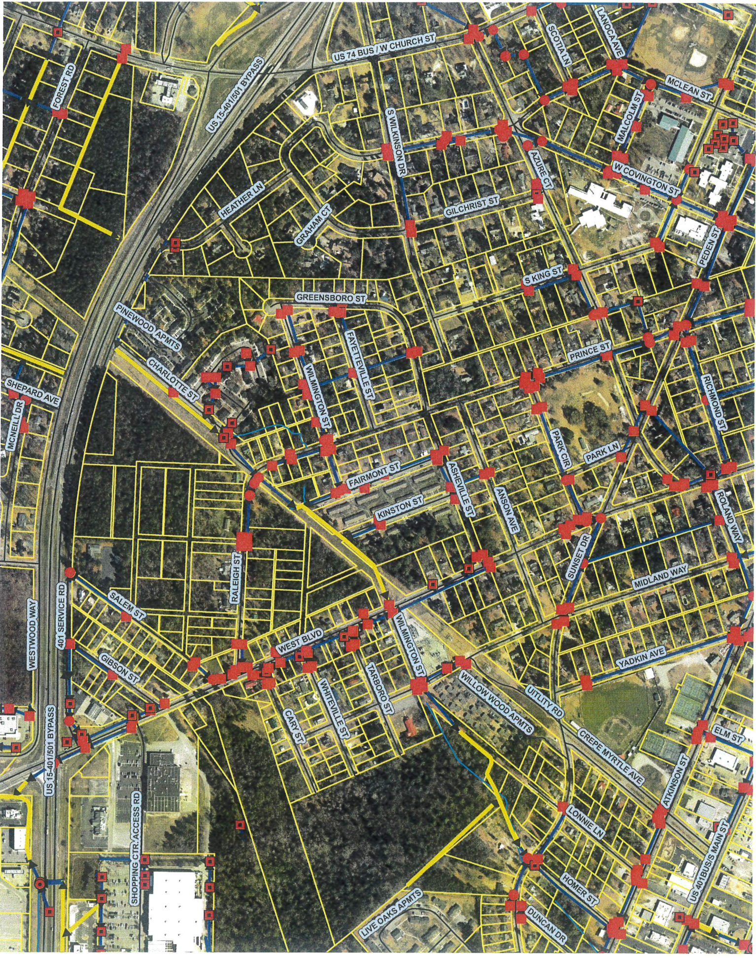
1600' Charlotte St.