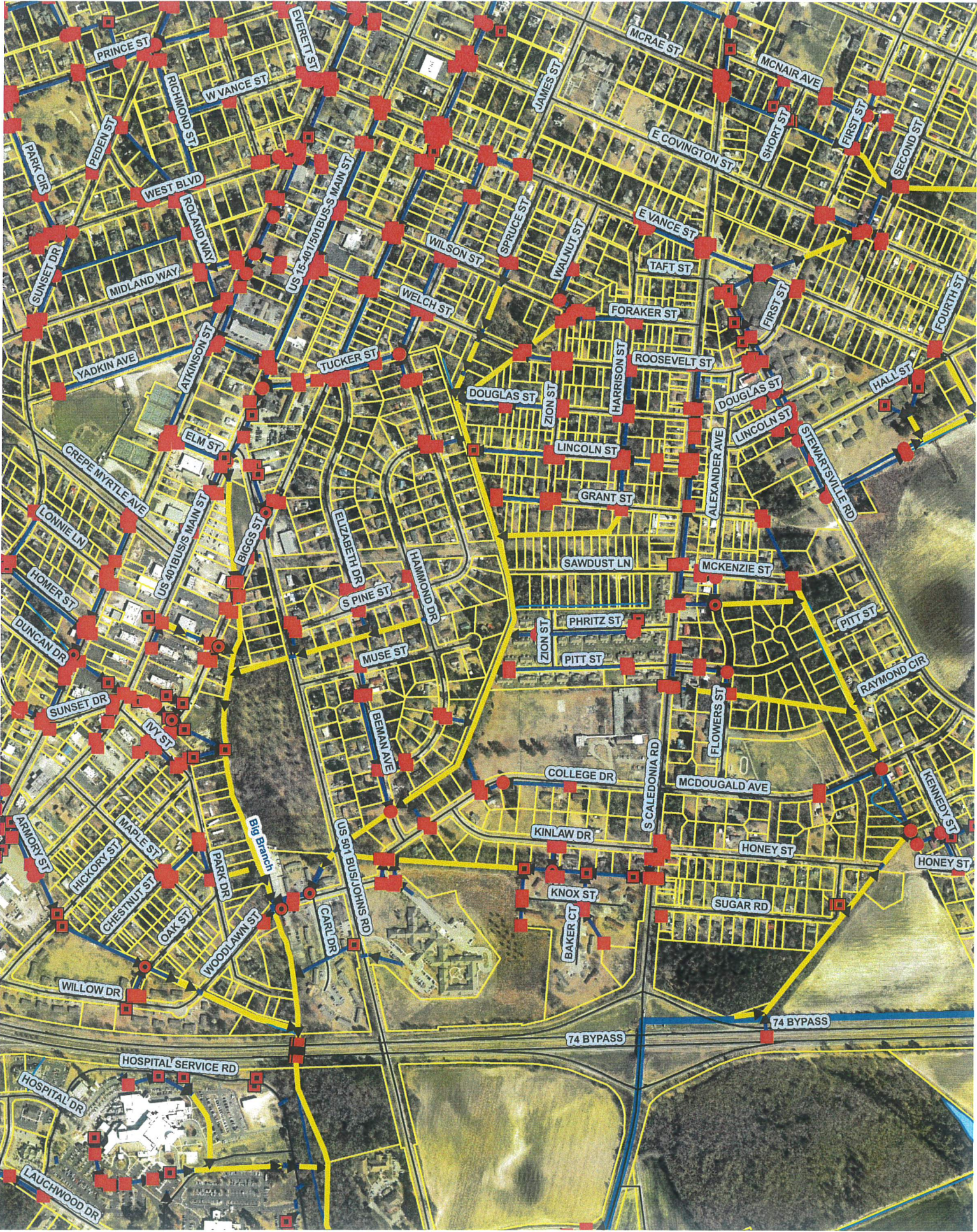
3600' Beaman Ave.