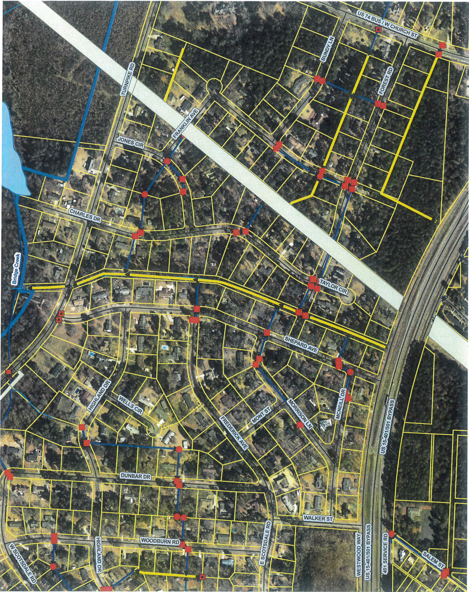
2400' Turnpike Rd.