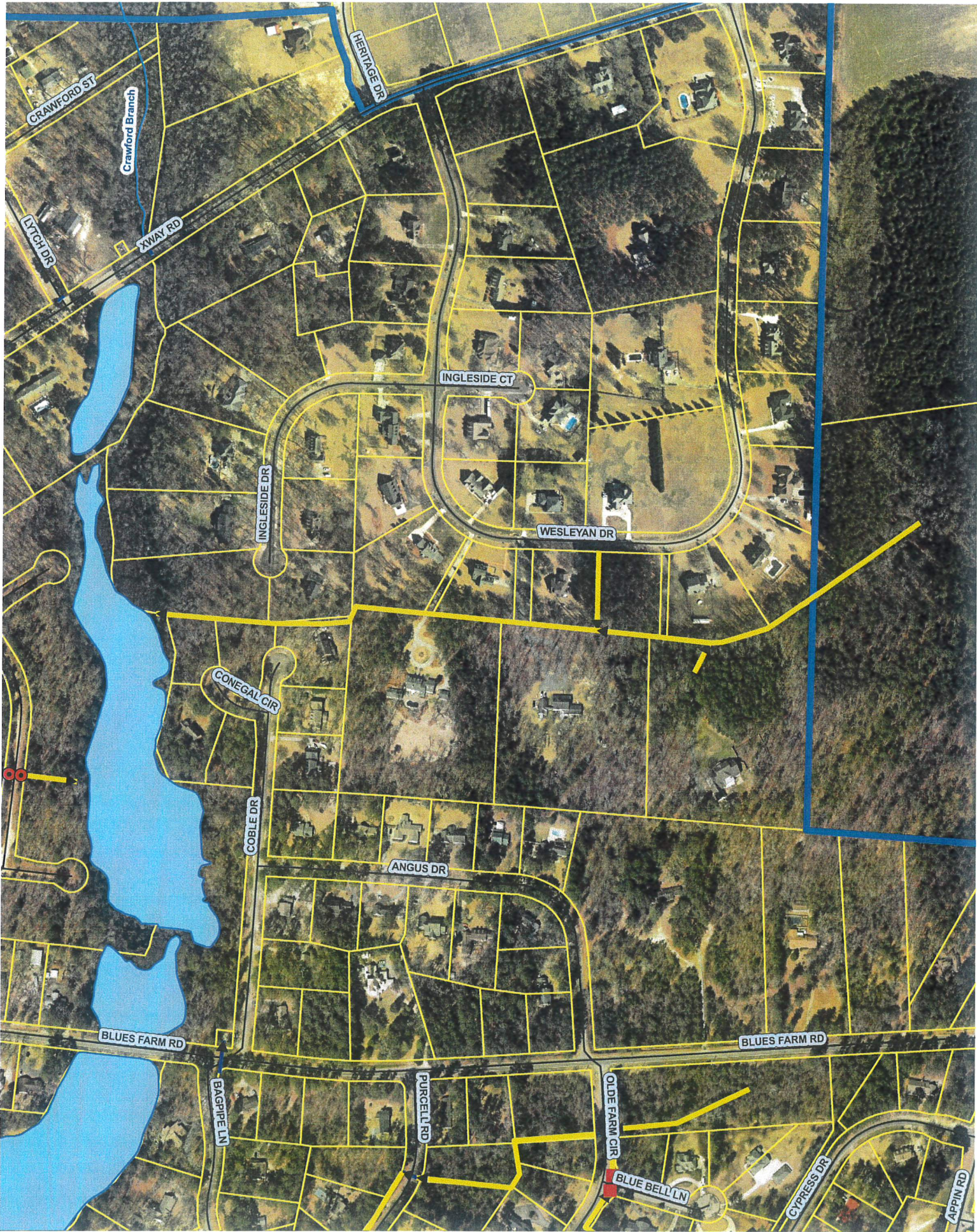
2000' Wesleyan Dr,