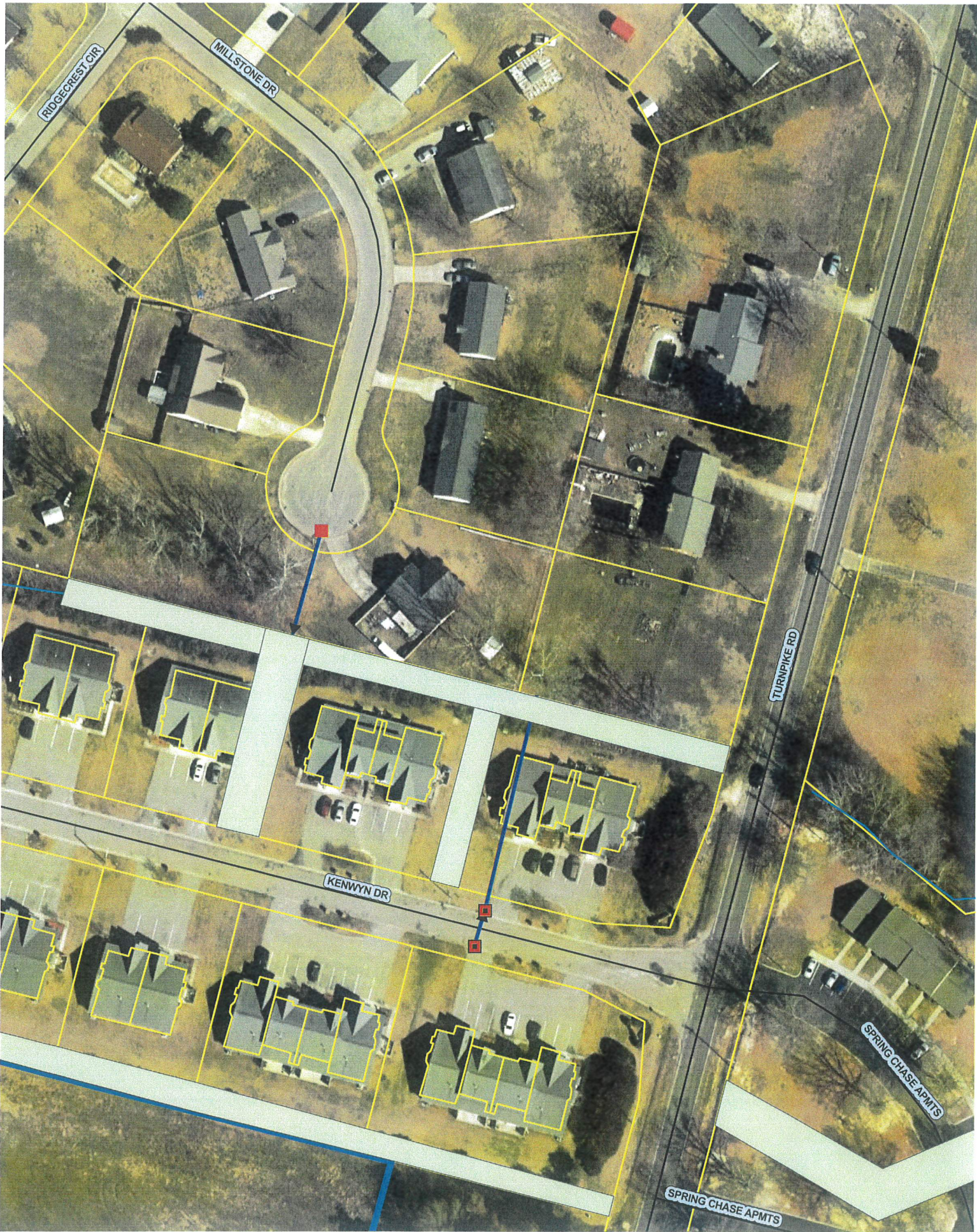
500' Kenwyn Dr,