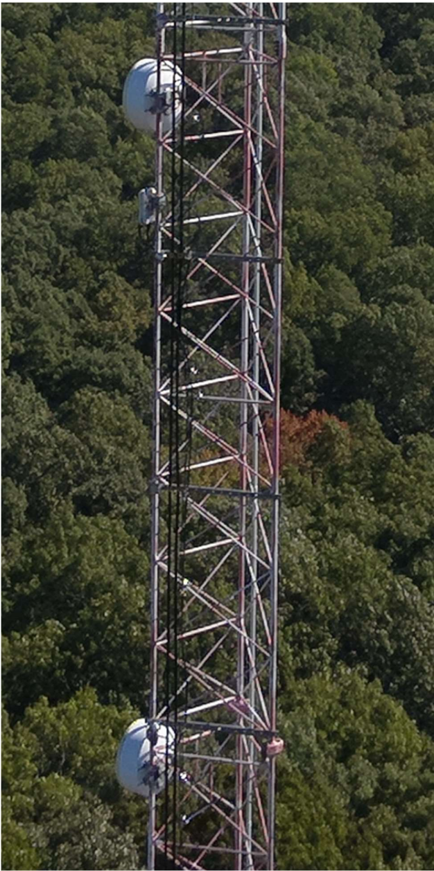
Figure 2 - 240' Microwave Array (Items C, D, E)