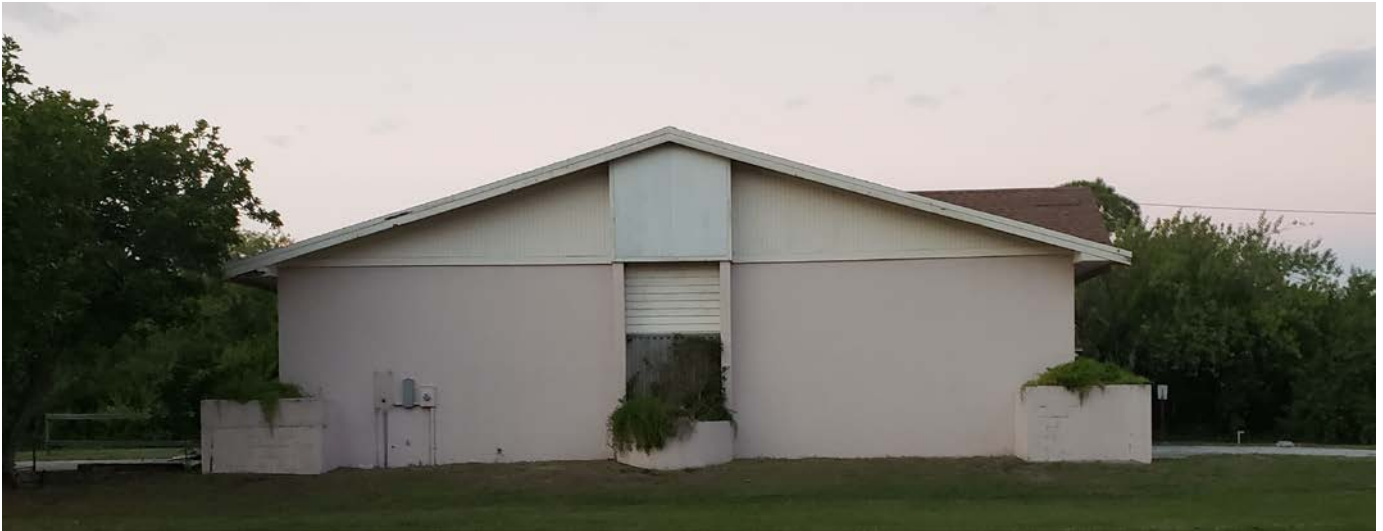
View from the south (12 th Avenue)