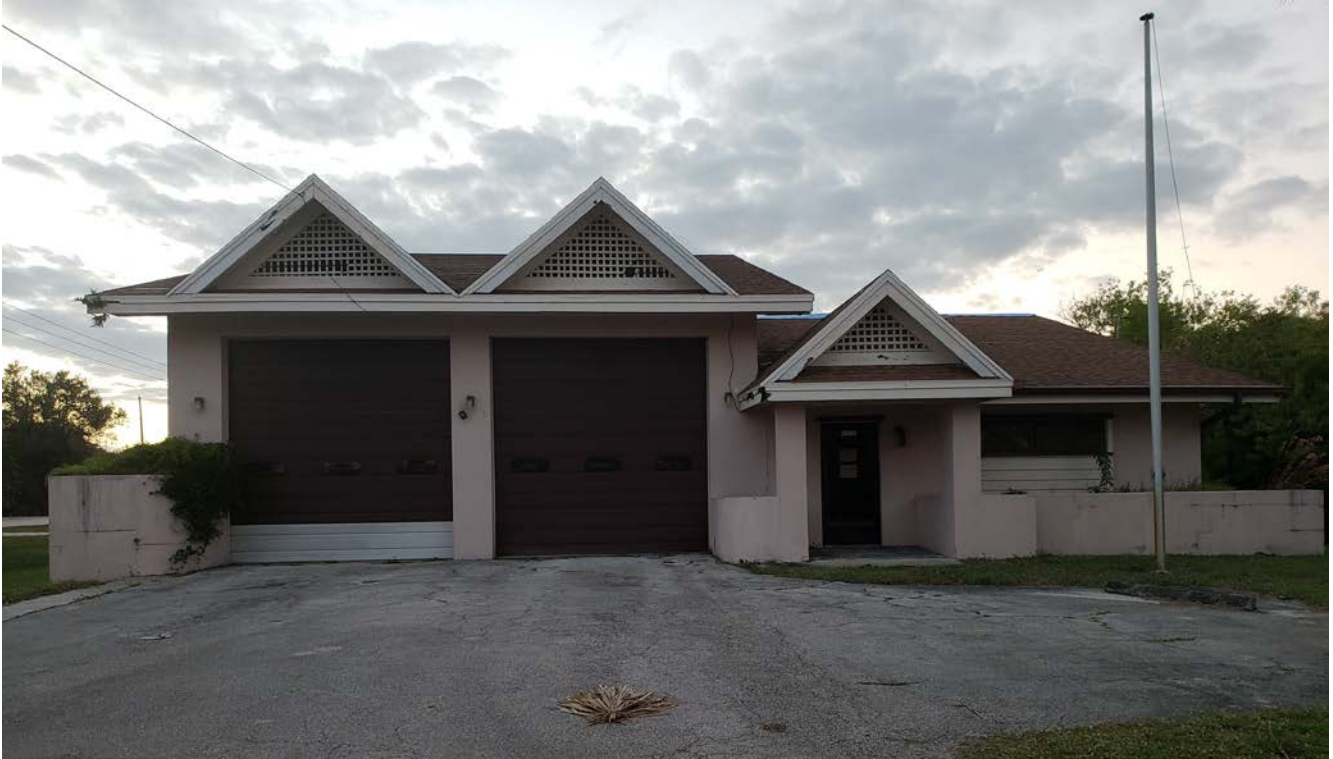
Front view of structure and drive from the east (82 nd Avenue)