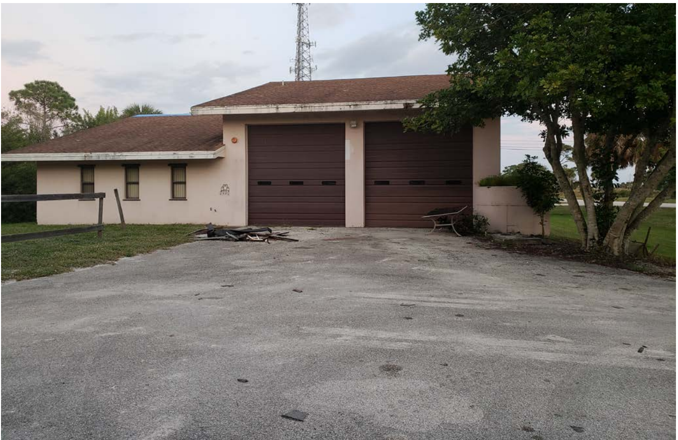
Rear view of structure and drive (from west)