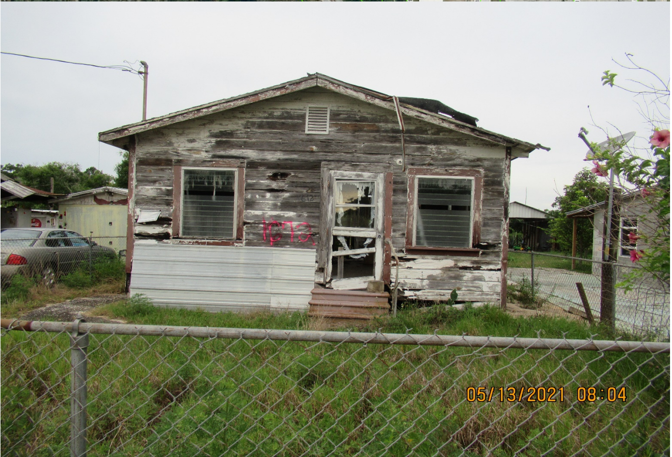
1672 Pardee Sub Road, Avon Park, Florida 33825