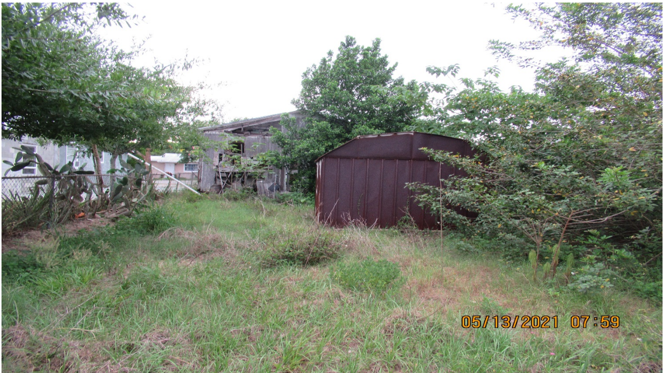
1672 Pardee Sub Road, Avon Park, Florida 33825