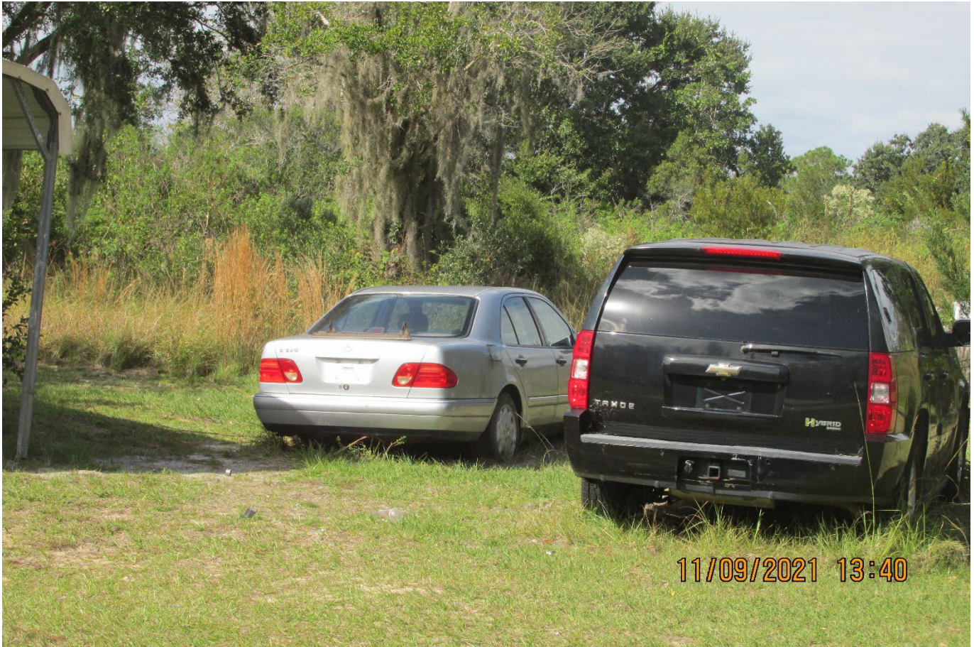
36 Henscratch Road, Lake Placid, Florida 33852 Parcel ID: C-24-36-28-010-0000-0170