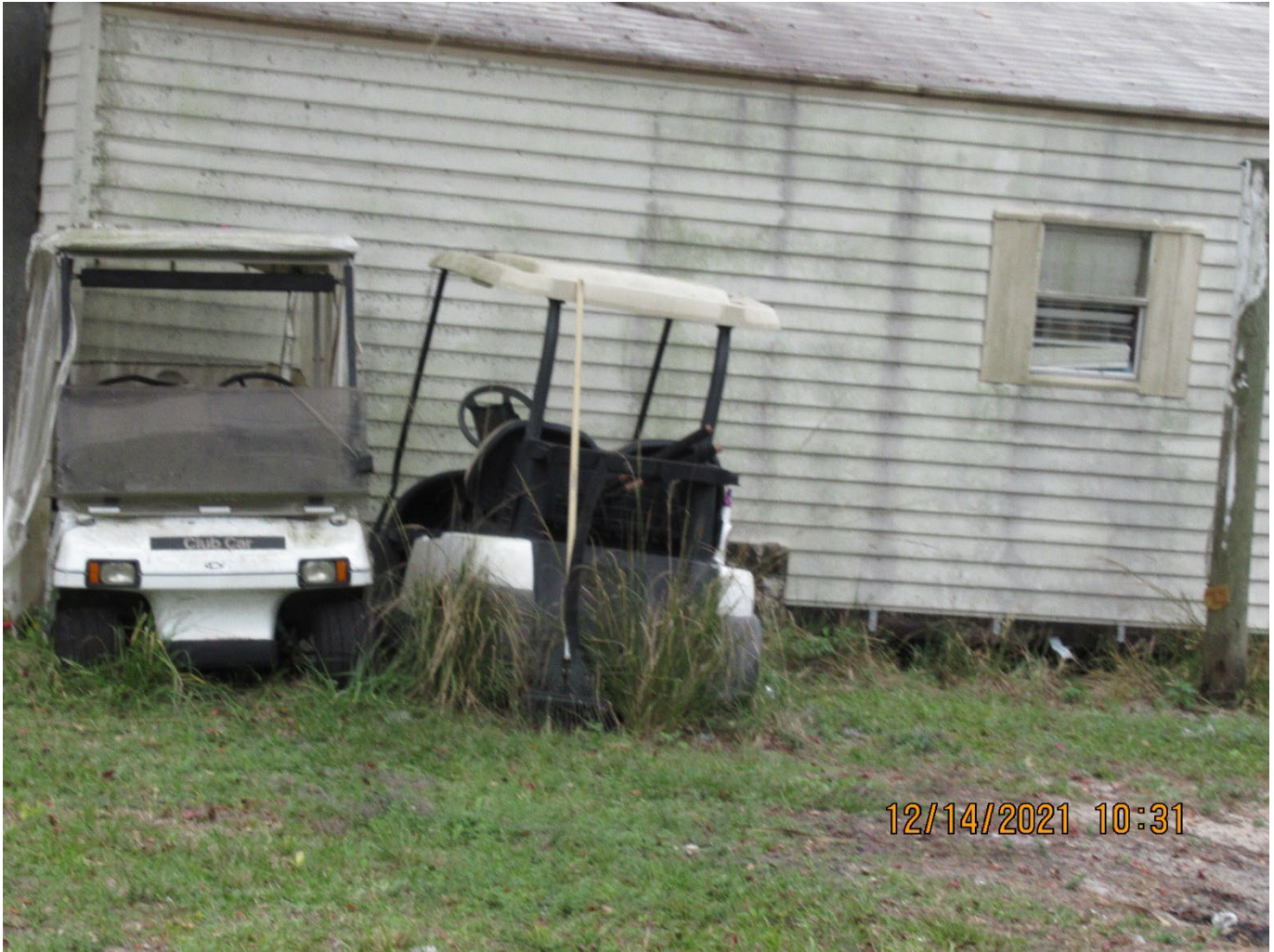
36 Henscratch Road, Lake Placid, Florida 33852 Parcel ID: C-24-36-28-010-0000-0170