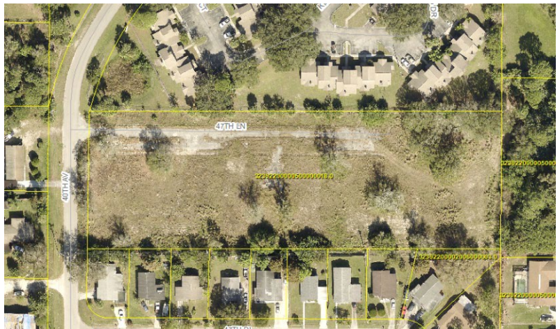
Aerial Photo, Former Gifford Gardens Site

The parcel is zoned RM-10, Residential Multi-family (up to 10 units per acre). Although this property has a multi-family residential zoning designation, single-family homes on as small as 7,000 square foot lots are permitted by right. Smaller single family housing lot sizes with reduced lot widths and setback requirements are possible under both the County's small lot subdivision regulations and under the County's Planned Development regulations (see Exhibit B ). Because of the relative small size and configuration of the parcel, it is anticipated that the property will be developed under either the small lot subdivision requirements or as a Planned Development.