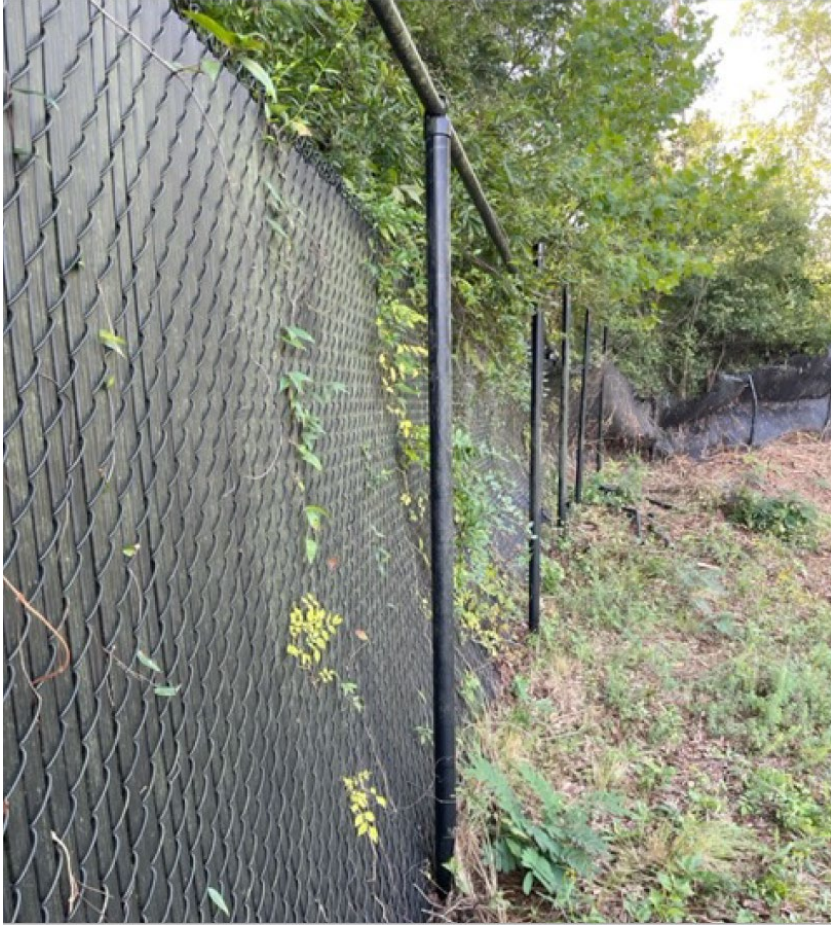
Existing Fence Condition

Irmo Elementary School (Part 2 of 4)- 7401 Gibbes St., Irmo, SC 29063