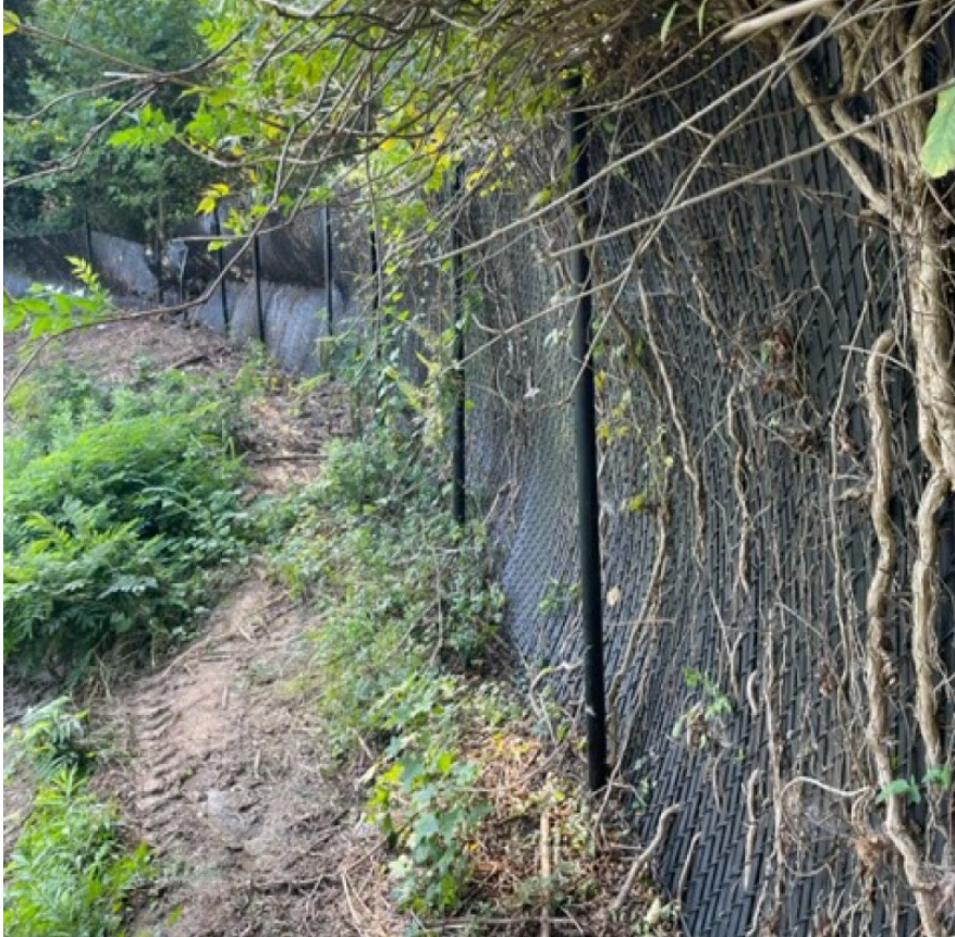
Existing Fence Condition

Irmo Elementary School (Part 3 of 4 continued)- 7401 Gibbes St., Irmo, SC 29063