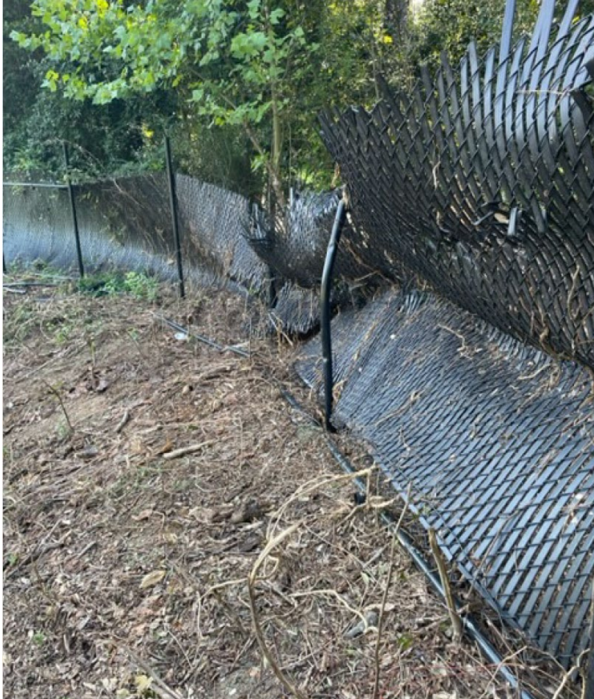
Existing Fence Condition

Irmo Elementary School (Part 4 of 4 continued)- 7401 Gibbes St., Irmo, SC 29063