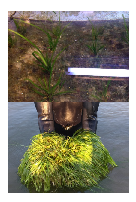
Figure 8 Clockwise from left (a) prepping and sewing burlap blocks, (b) burlap blocks incubating, (c) planting burlap bag blocks.