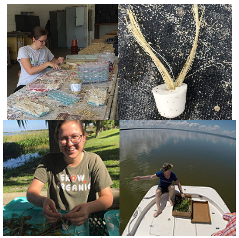
Figure 4 Clockwise starting from the top left (a) process of creating plaster blocks (b) a hardened plaster block (c) plaster blocks being attached to Potamogeton, (pondweed) (d) Vallisneria (eelgrass) with plaster of paris blocks being deployed from boat.