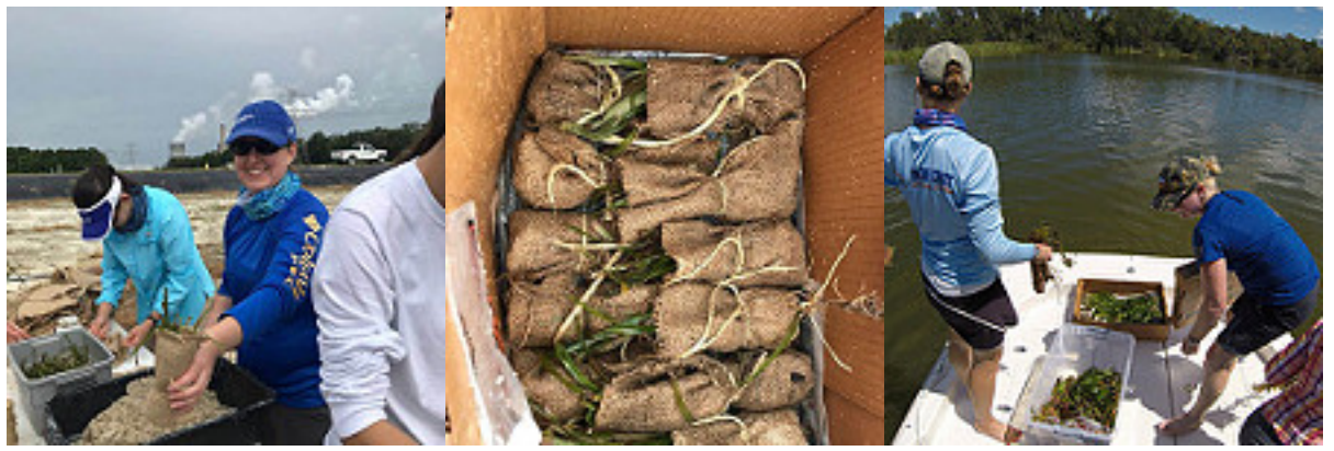
Figure 7 From left to right (a) prepping burlap wraps, (b) transporting burlap wraps, and (c) deploying burlap wraps.

Like choir mats and peat pots, the goal of burlap wraps is to reduce transplant stress. Plants are collected with some attached sediment and the belowground tissue is wrapped in burlap and closed with twine. Additional sediment and/or fertilizer can also be added to the wrap to ensure good growing conditions and to make sure the burlap wrap 'burrito' is heavy enough to sink. The wraps are easily transported to the field and can be dropped from the water surface. The weight of the sediment will cause the plants to sink, and the sediment environment will stay intact until the wrap decomposes after which the plants can expand laterally.