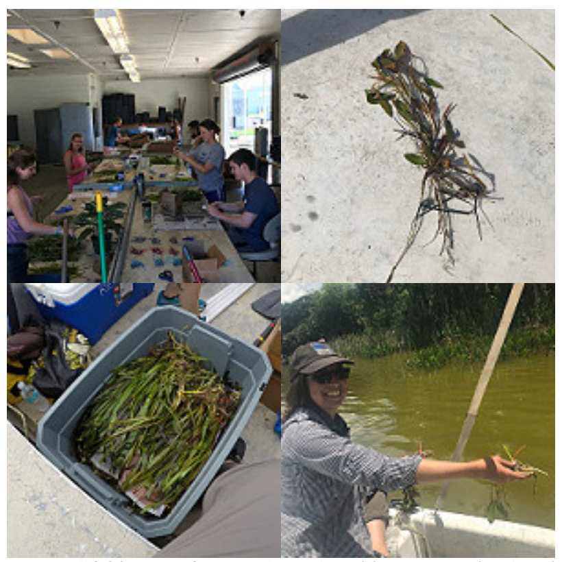
Figure 3 Clockwise starting at top left (a) process of tying weights to plants, (b) Potamogeton (pondweed) with attached weights, (c) Vallisneria (eelgrass) with tied weights, (d) weighted Potamogeton being deployed from boat.

The goal of this method is to overcome the issue of scaling up associated with the time-consuming method of hand planting individuals. With this method, a non-lead fishing weight is attached to a bare root plant using a zip tie. These weighted plants can be tossed over the side of a boat and will sink to the bottom because of the weight. The weight will hold the plant in place until it can root.