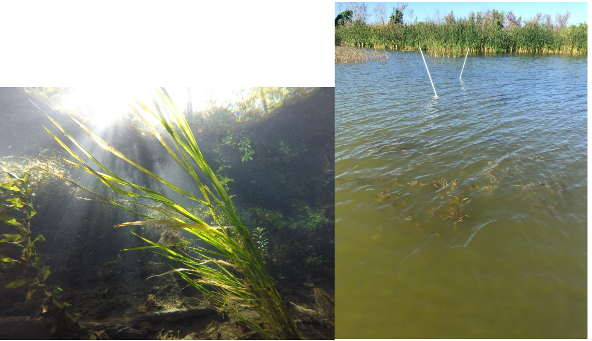
Figure 1 From left to right (a) SAV meadow in clear spring water. (b) pondweed seen from the surface of a dark lake.

The positive impacts of SAV depend on the persistence of the plants and the size and density of the meadow. Ephemeral patches of SAV are not as valuable as habitat if animals live longer than the meadow. Likewise, once plants disappear, their benefits wane, as sediments can be resuspended and decrease water clarity, which can limit colonization by new plants. Furthermore, smaller isolated meadows are less effective at trapping sediment and providing habitat (Hansen and Reidenbach 2012). Therefore, a goal of restoration is to create large patches of SAV that persist through time.