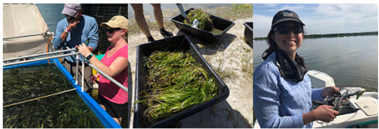
Figure 2 From left to right (a) growing Vallisneria (eelgrass) in tanks, (b) collected bare root Vallisneria, (c) wrapped Vallisneria to maintain moisture.