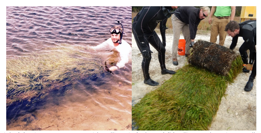
Figure 5 From left to right (a) coir mat grown out with Vallisneria (eelgrass) (b) rolling up the coir mat.