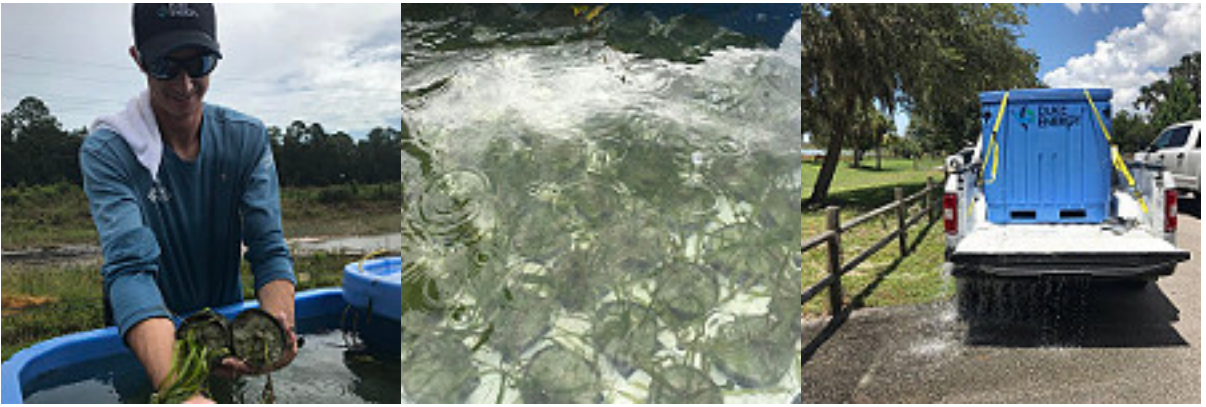
Figure 6 From left to right (a) newly established Vallisneria (eelgrass) and Potamogeton (pondweed) peat pots, (b) incubating peat pots, and (c) transporting peat pots to the restoration site. All photos were taken by authors.

Like coir mats, the goal of peat or coconut pots is to reduce transplant stress. Small decomposable pots made of either peat or coconut coir are filled with sand and placed into a similar size plastic pot. Typically, an individual bare root plant is planted into the pot, and the pots are allowed to incubate for at least a month.; however, this method is flexible and can be planted with multiple shoots or incubated longer. During that time, plants grow, and overcome any transplant shock within the controlled growing conditions of the tank. Those pots can then be transported to the field where the plastic pot is removed and re-used and the decomposable pot can either be placed on the sediment surface or dropped from the water surface. The weight of the sediment in the pot will cause the plants to sink, and the sediment environment will stay intact until the pot decomposes after which the plants can expand laterally.