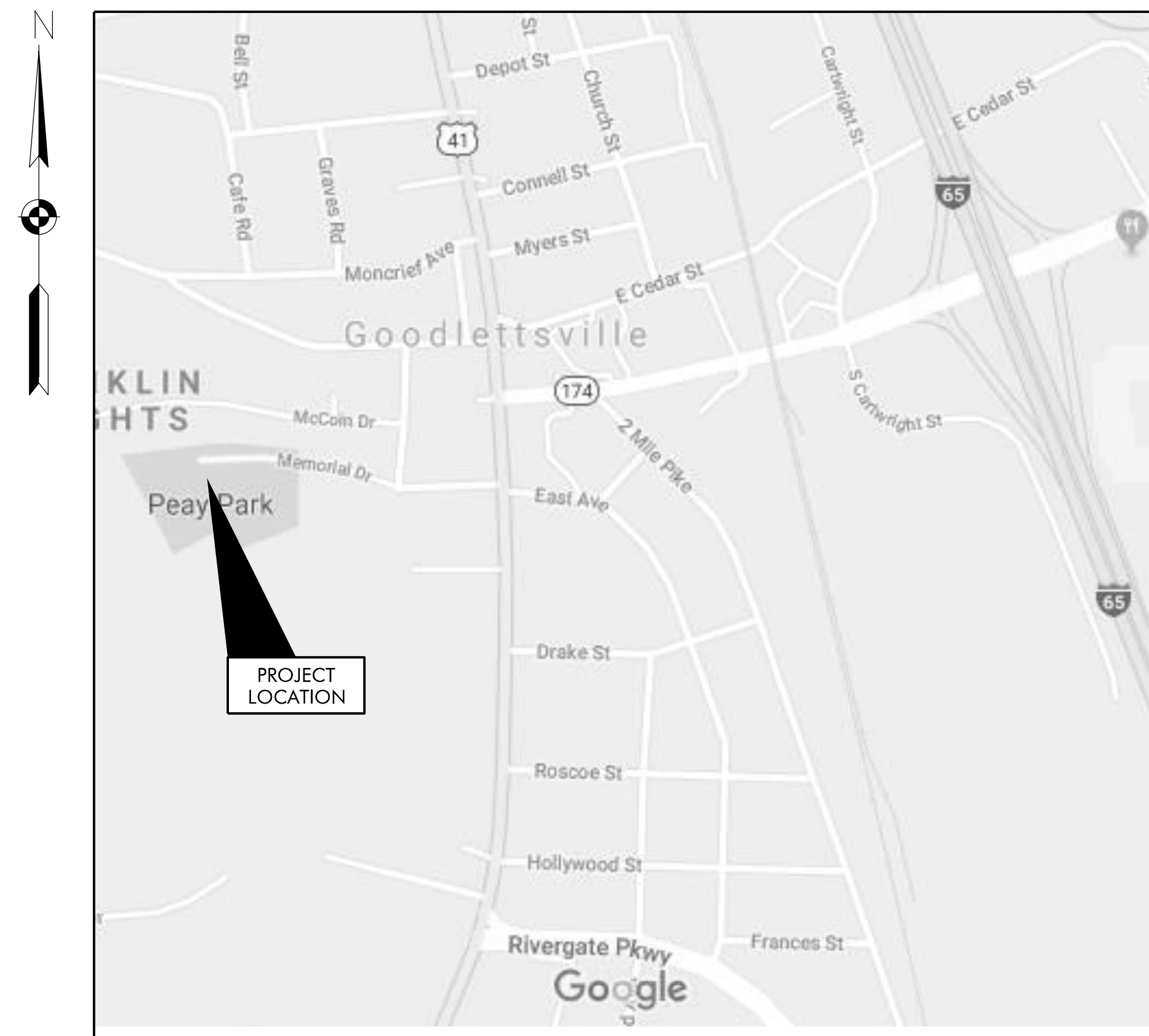
VICINITY MAP SCALE: NONE

200 MEMORIAL DRIVE GOODLETTSVILLE, DAVIDSON COUNTY, TENNESSEE