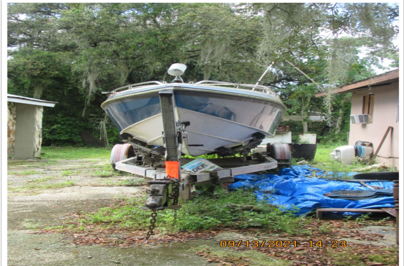
113 Lawrence Avenue, Sebring, Florida 33870