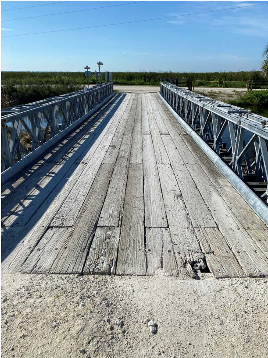
Bridge near Unit 2 Pump Station