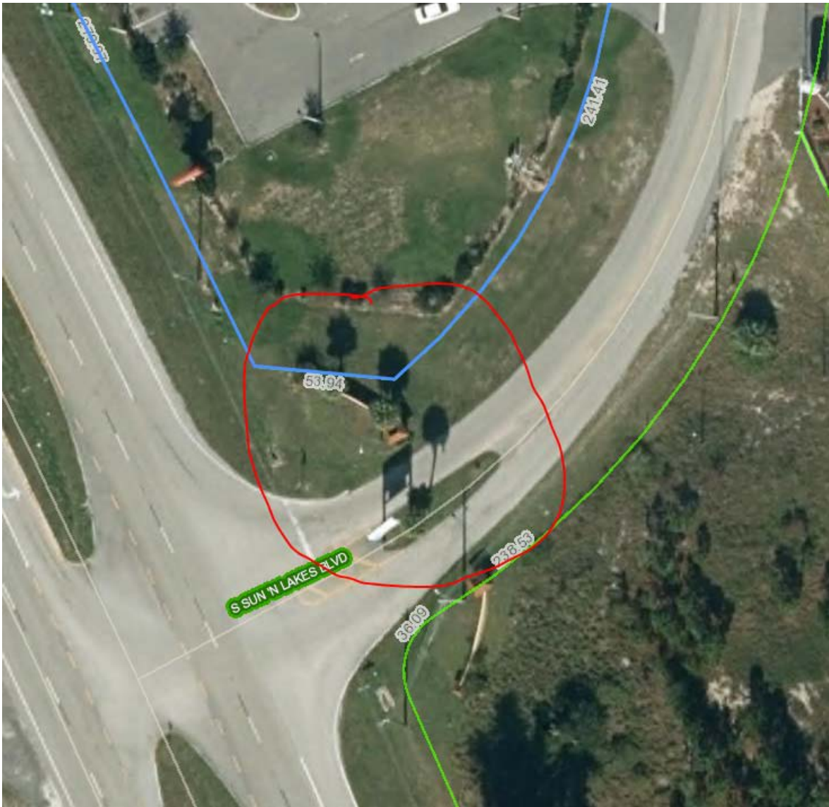
Entrance at US 27 and S.Sun N Lakes Blvd