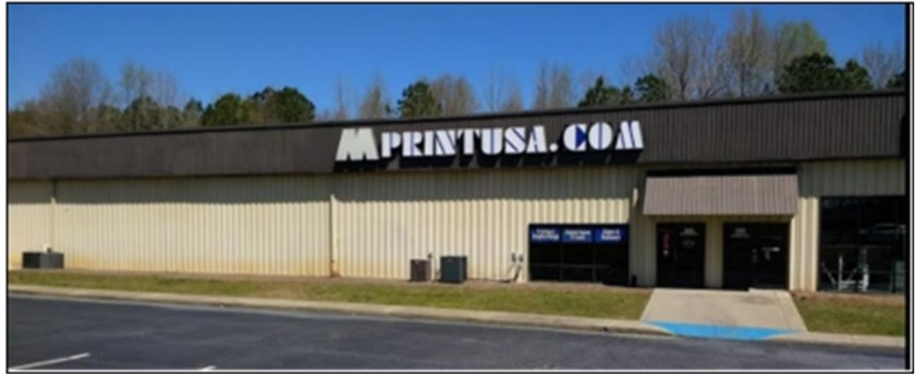
Print Shop Building 1680 Dogwood Dr SE, Conyers, Rockdale County, Georgia 30013