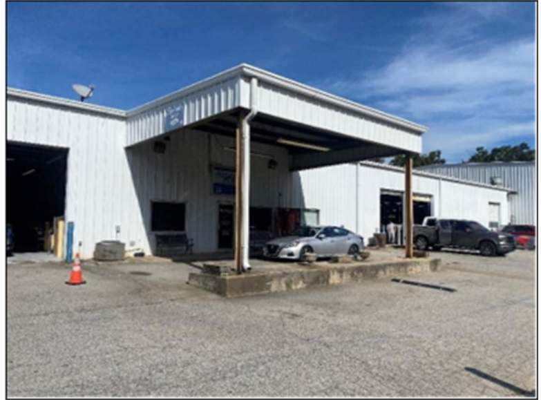
Page 13 of 42