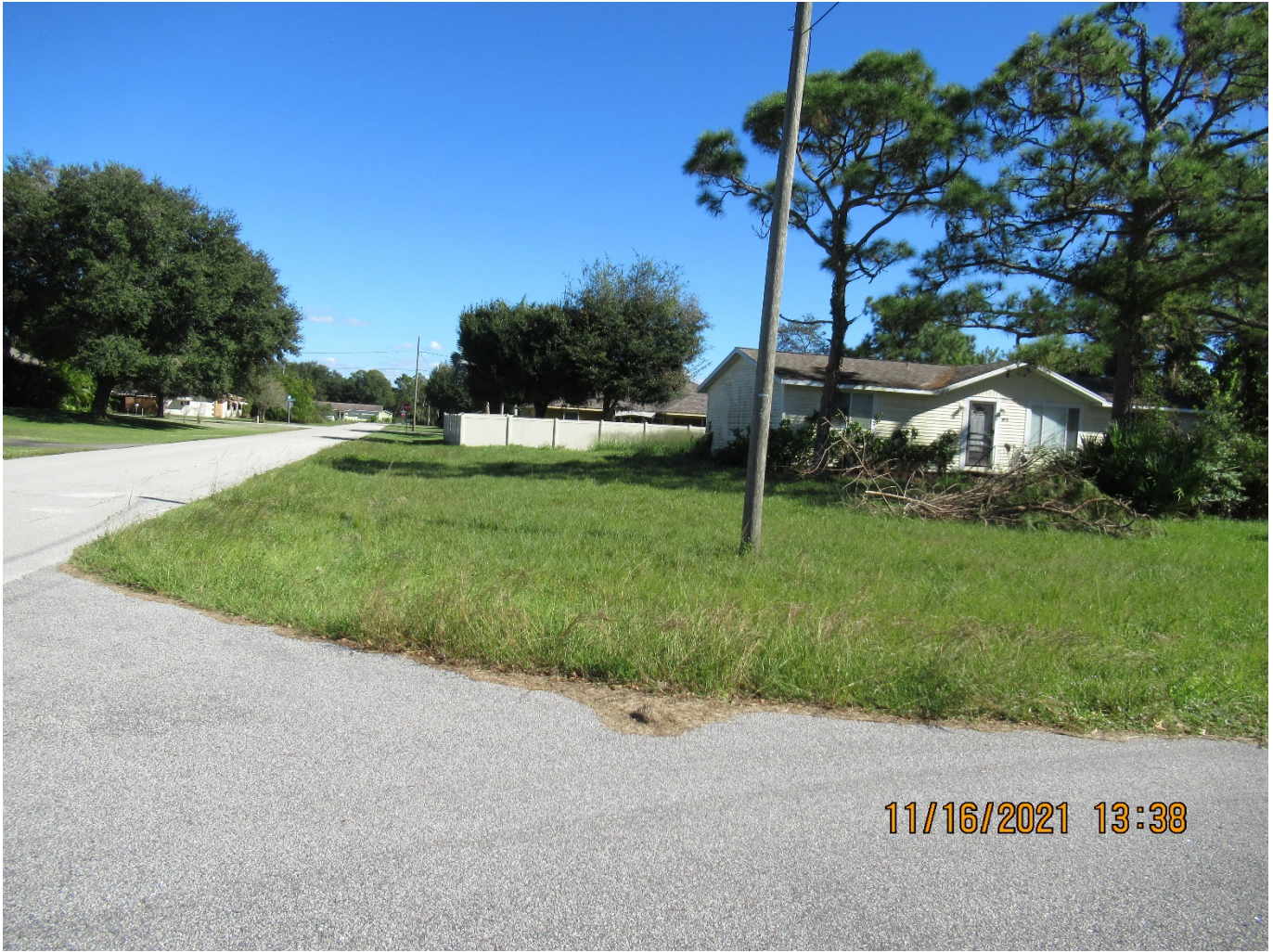
1601 Chatsworth Street, Lake Placid, Florida 33852 Parcel: C-29-36-30-040-0000-6320