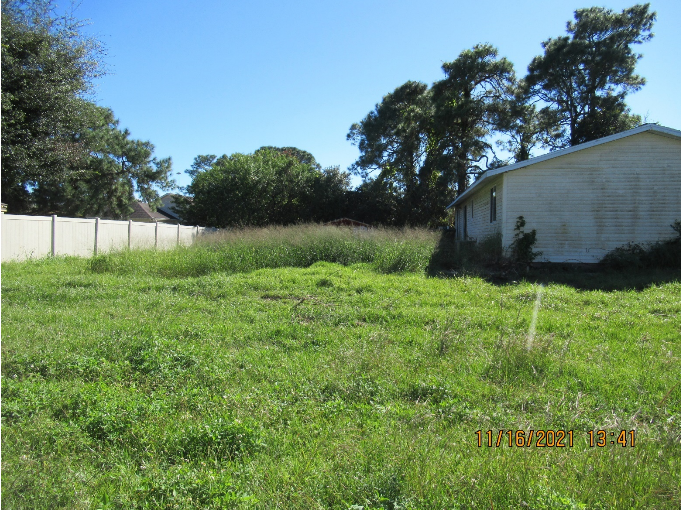
1601 Chatsworth Street, Lake Placid, Florida 33852 Parcel: C-29-36-30-040-0000-6320