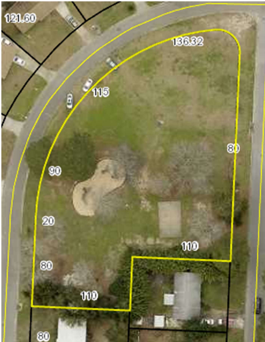
Lot size/ Dimensions –