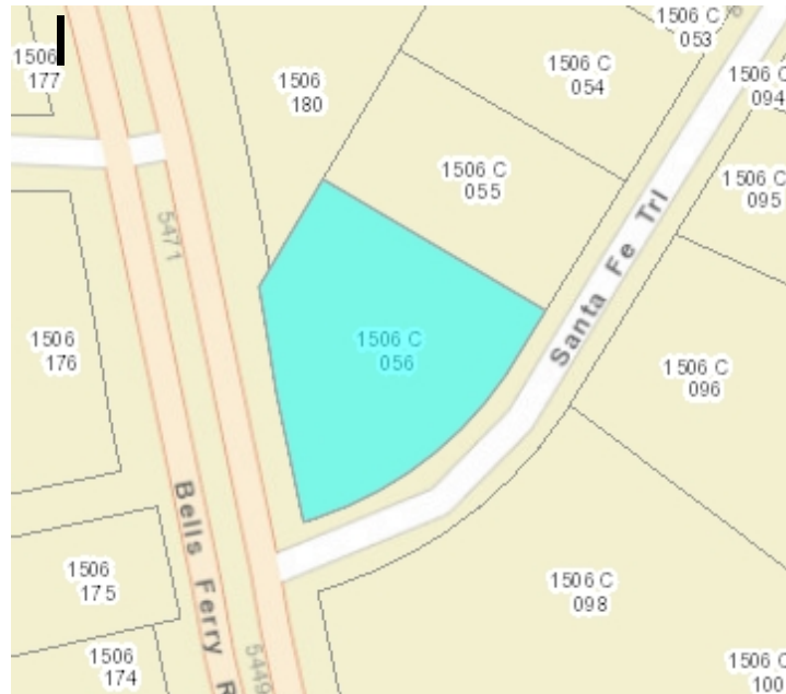
Tax parcel highlighted in cyan