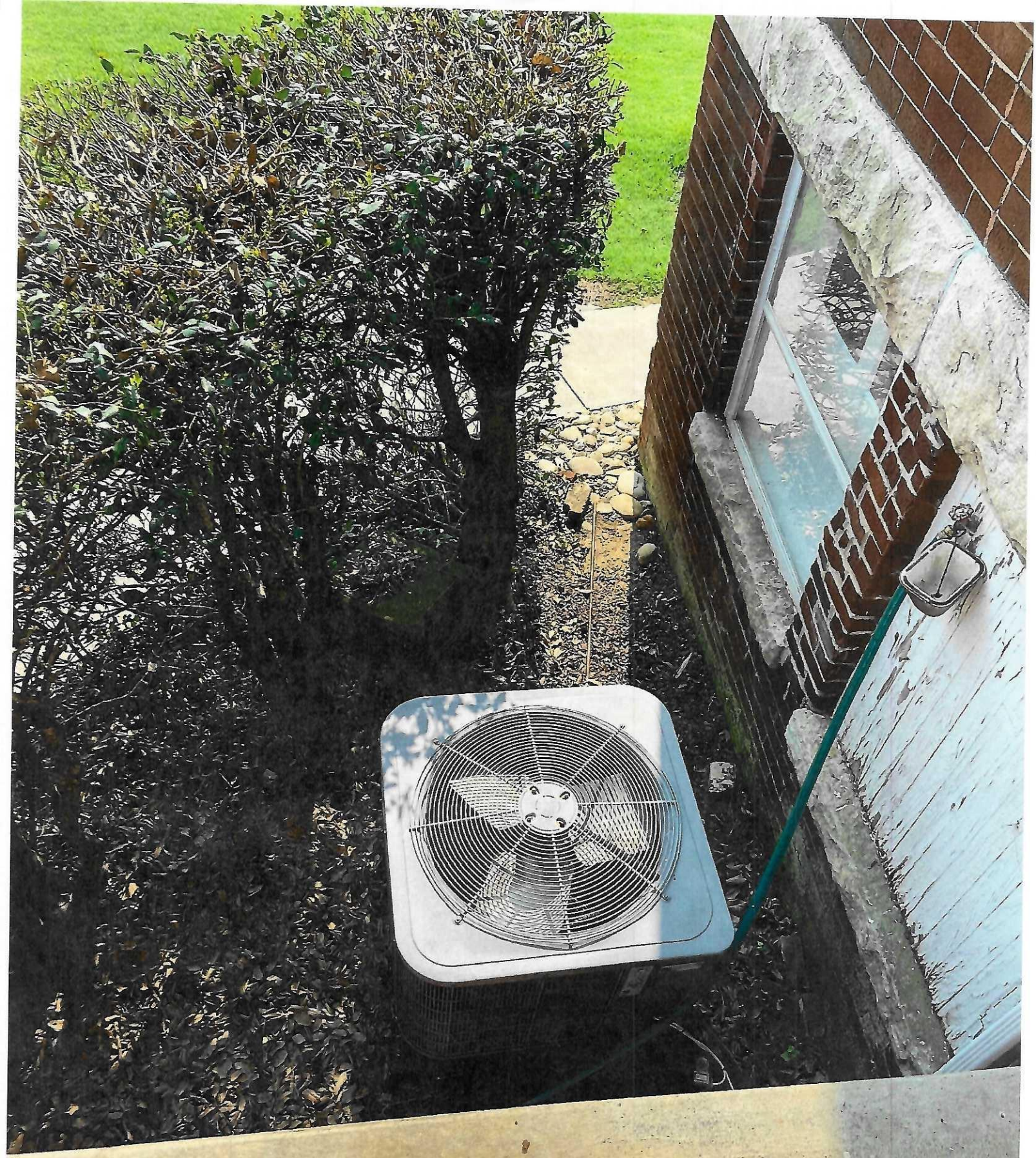
HVAC-01 MC Courthouse