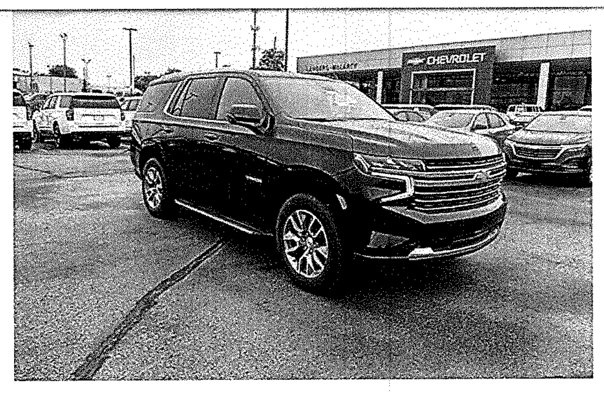
Buy Online Now