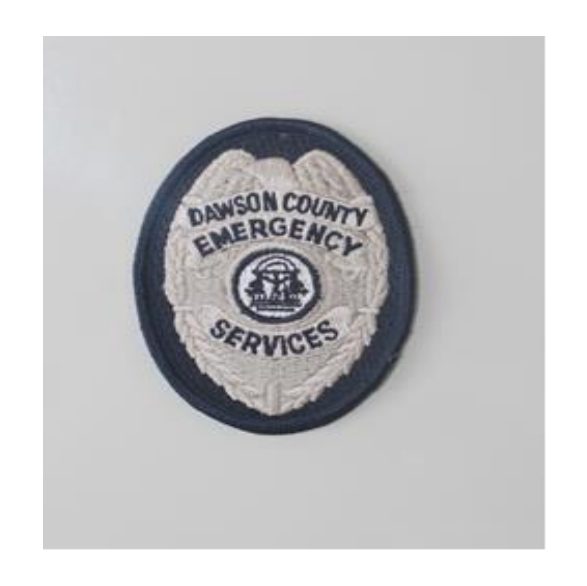
DAWSON COUNTY EMERGENCY SERVICES BADGE SILVER: FIRE