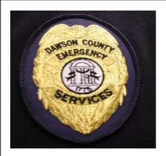
DAWSON COUNTY EMERGENCY SERVICES BADGE GOLD: RANKS BATTALION CHIEF THROUGH EMA DIRECTOR