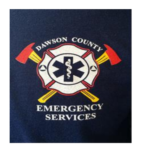
DAWSON COUNTY EMERGENCY SERVICES LOGO