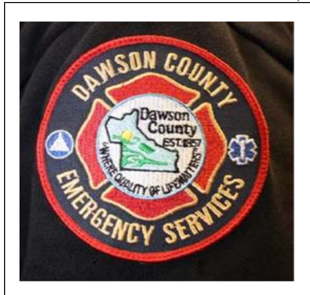
DAWSON COUNTY EMERGENCY SERVICES PATCH