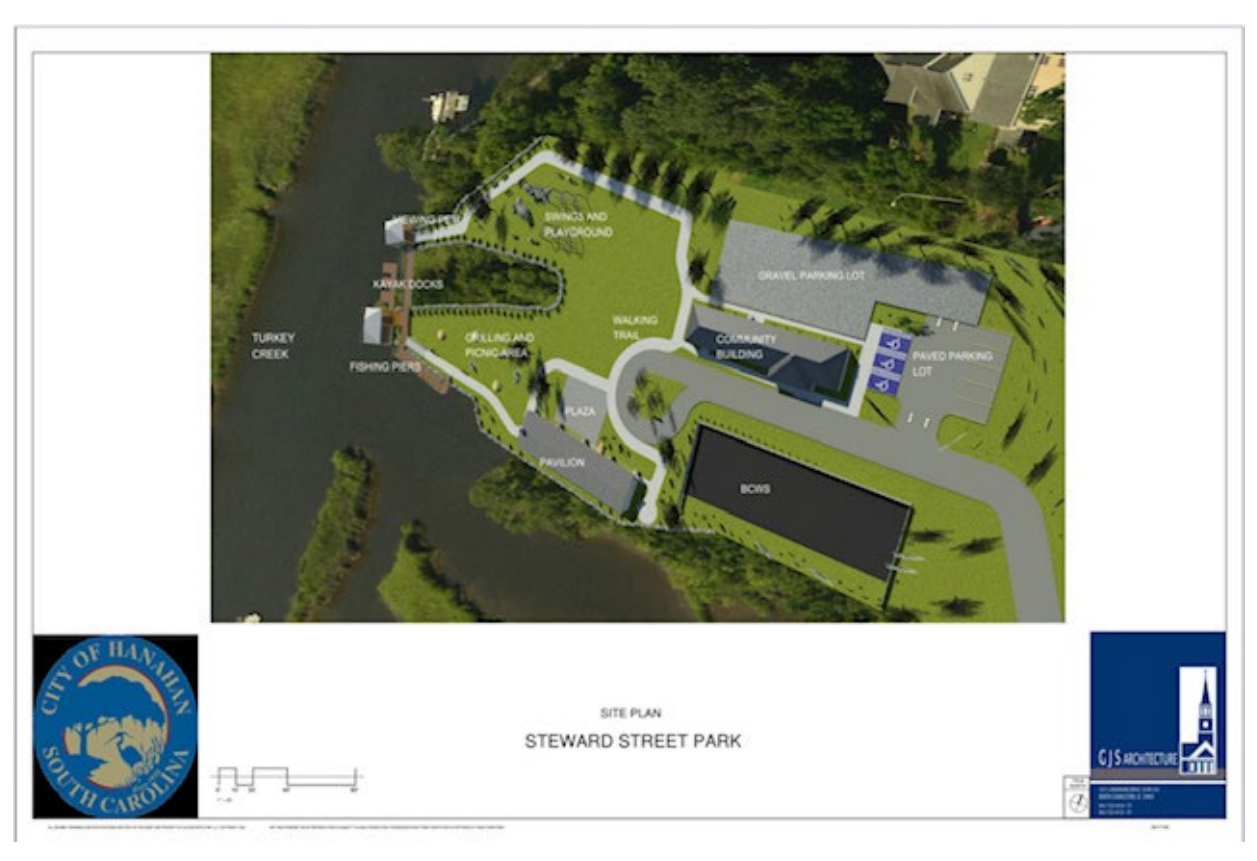
City of Hanahan - Conceptual - Steward Street Park