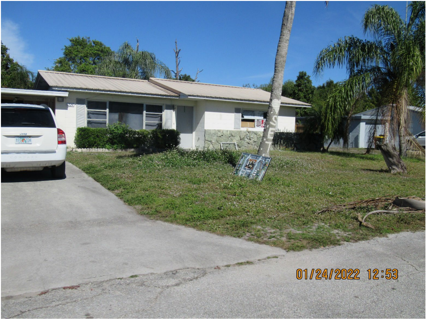
224 Sunnybrook Lane, Lake Placid, Florida, 33852 Parcel ID: C-22-37-30-030-00R0-0160