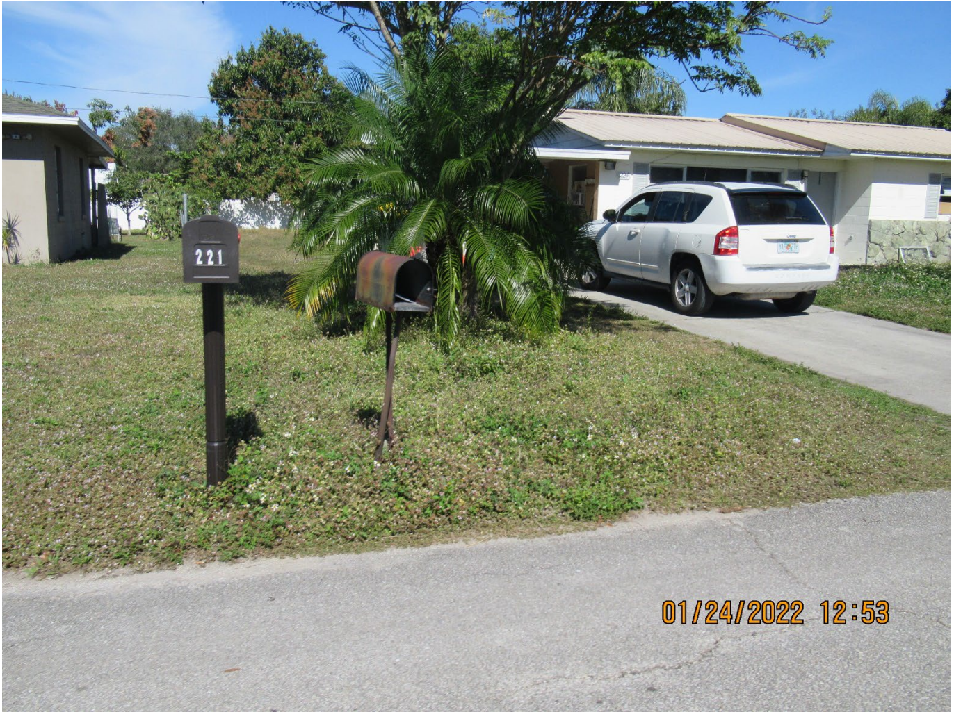
224 Sunnybrook Lane, Lake Placid, Florida 33852 Parcel ID: C-22-37-30-030-00R0-0160