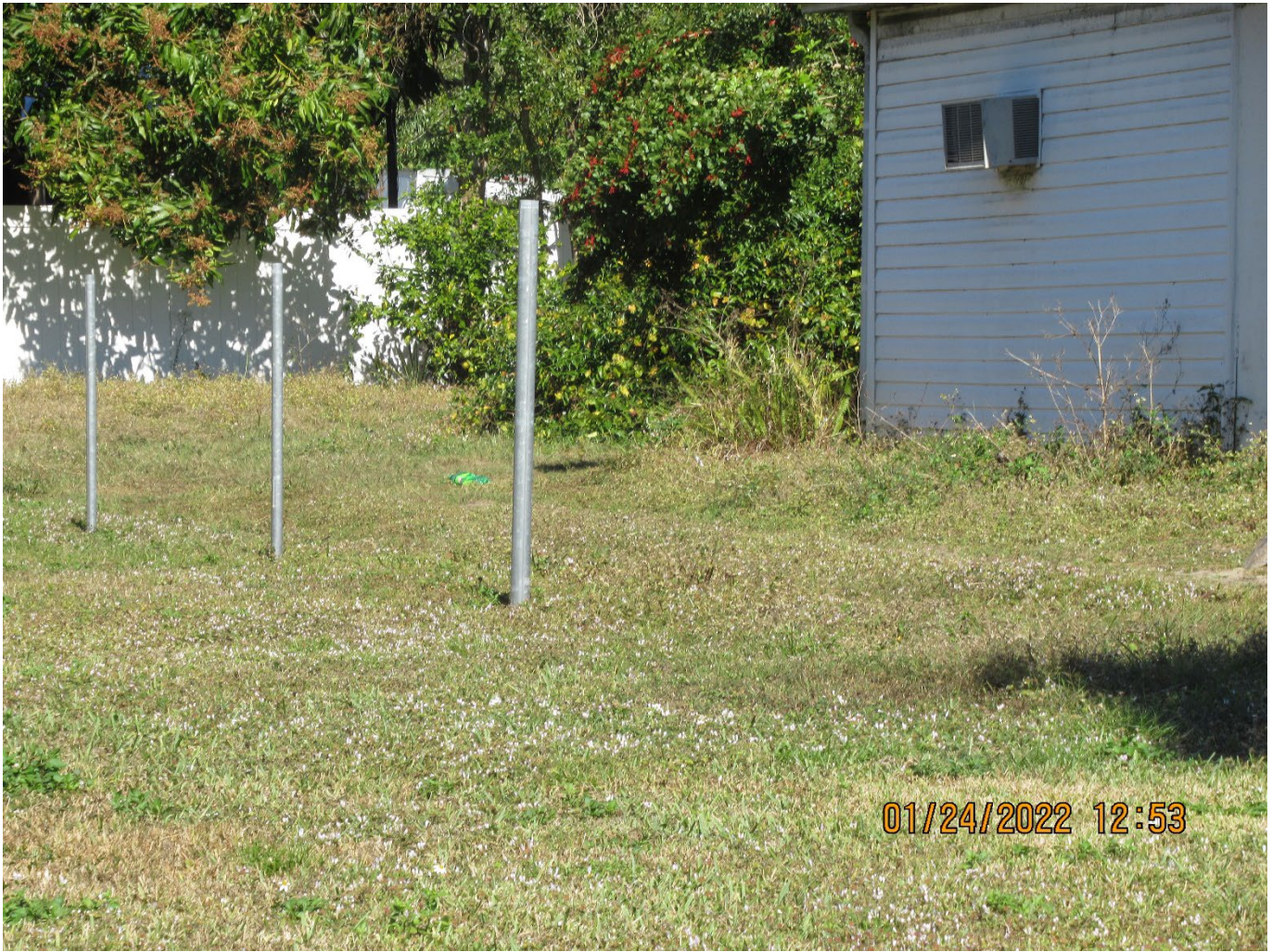
224 Sunnybrook Lane, Lake Placid, Florida 33852 Parcel ID: C-22-37-30-030-00R0-0160