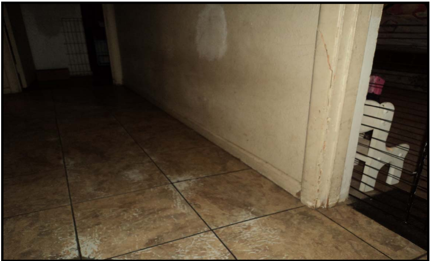
Photo No. 2: REPRESENTATIVE VIEW OF BASEBOARDS THAT ARE COATED WITH LEAD-BASED PAINT.