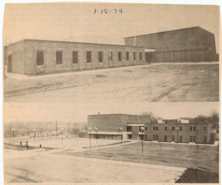
MODEL CITIES BROTHERHOOD PARK CENTER on Oakland Avenue was opened to the public on Monday featuring a gymnasium, craft shops and general recreation facilities. The lower level of the center will house a 90-child Day Care Center under the direction of the County Department of Social Services while the top level provides office space for representatives of the police department's Community Relations program, the Office of Economic Opportunity and Model Cities representatives. The facility is staffed by four employes from the old T. K. Gregg Center which was closed when the new facility opened. The Day Care Center is expected to open in the near future. Shown are front (top photo) and rear views of the facility.

salon, and a few midwives. Photographs of the area reveal that many of the small homes were not well built and had degraded rapidly by the 1950s. This area becomes the focus of Spartanburg's first Urban Renewal site with remodeling, house moving, and demolition occurring during 1960 and 1961. Most of the area remained vacant through the rest of the 1960s, but a need for a new Northside recreation center to replacing the 1930s-era T. K. Gregg Center off of Evins Street made this spacious site an attractive option for the city. In 1974, the Brotherhood Recreation Center opened, featuring a large gymnasium, art classrooms, conference