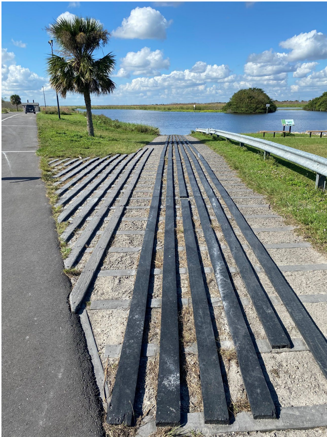
EXHIBIT 3 — PROJECT LOCATION FELLSMERE GRADE AIRBOAT RAMP