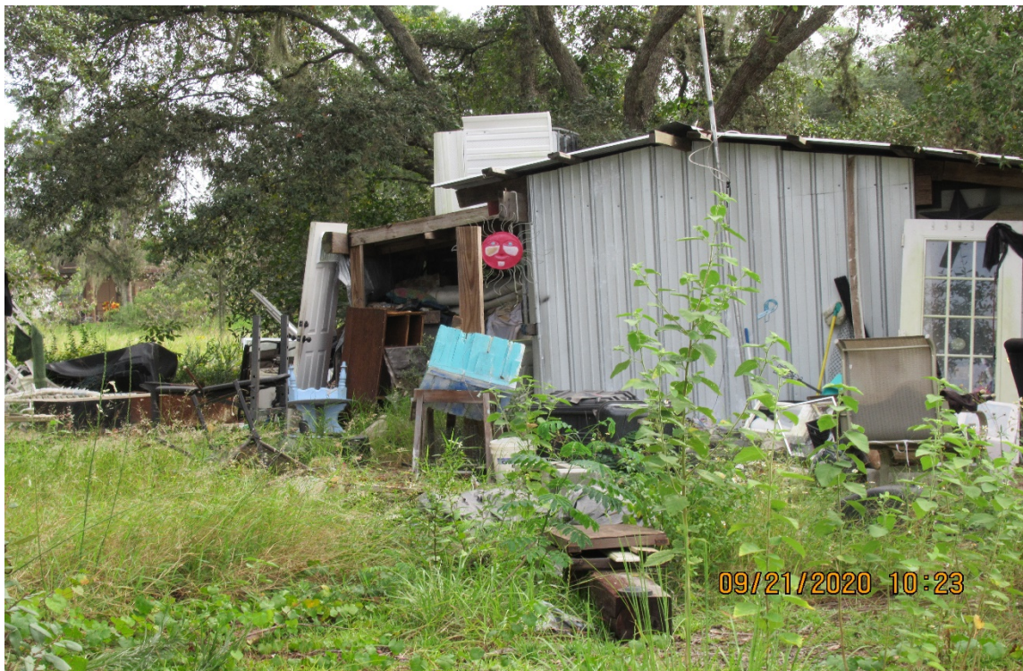
3190 North Hobart Road, Avon Park