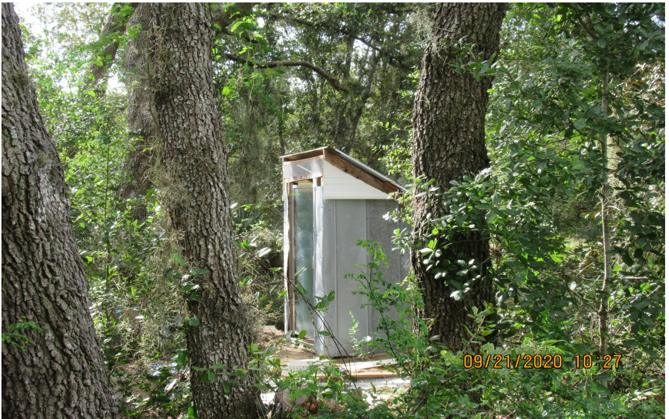
3190 North Hobart Road, Avon Park