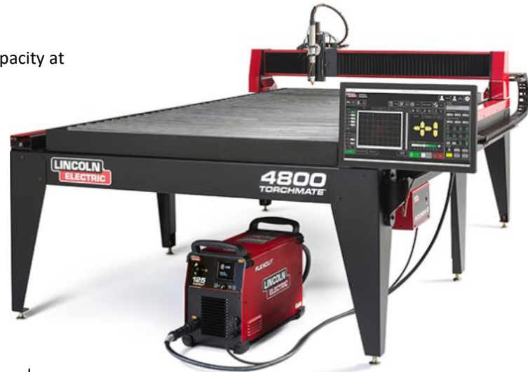
Lincoln Electric Torchmate 4800 Plasma Cutting Table