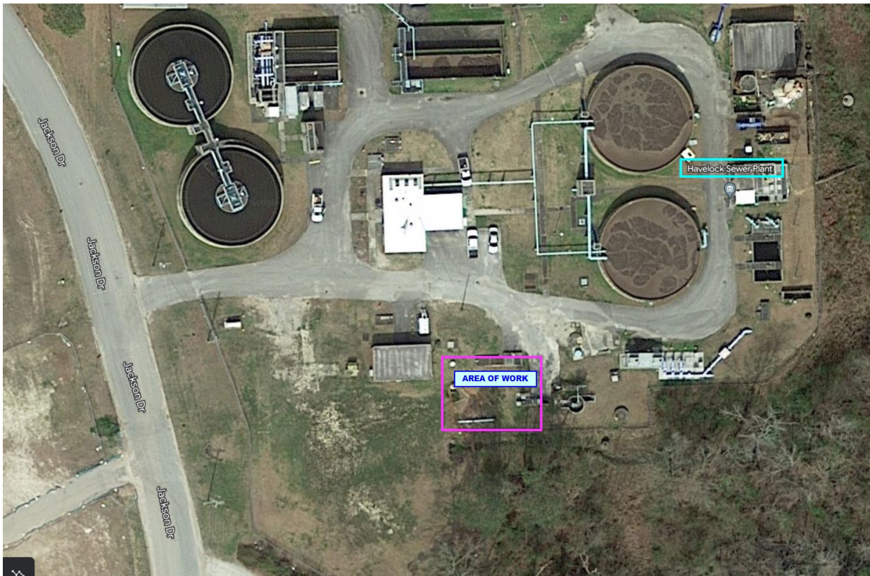
Figure 1. Work area and vicinity map