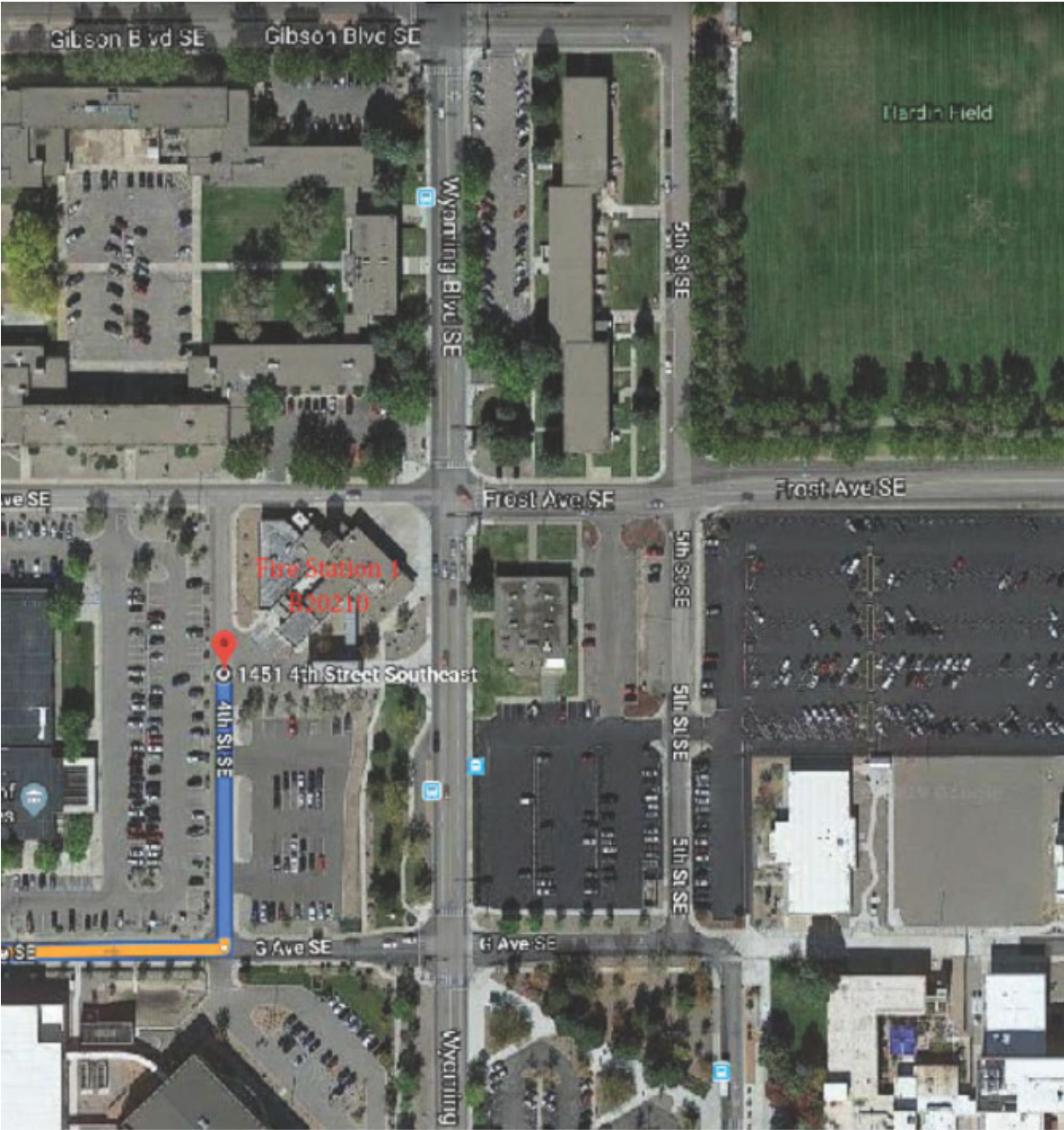
Fire Station B20210 1451 4th Steet Southwest