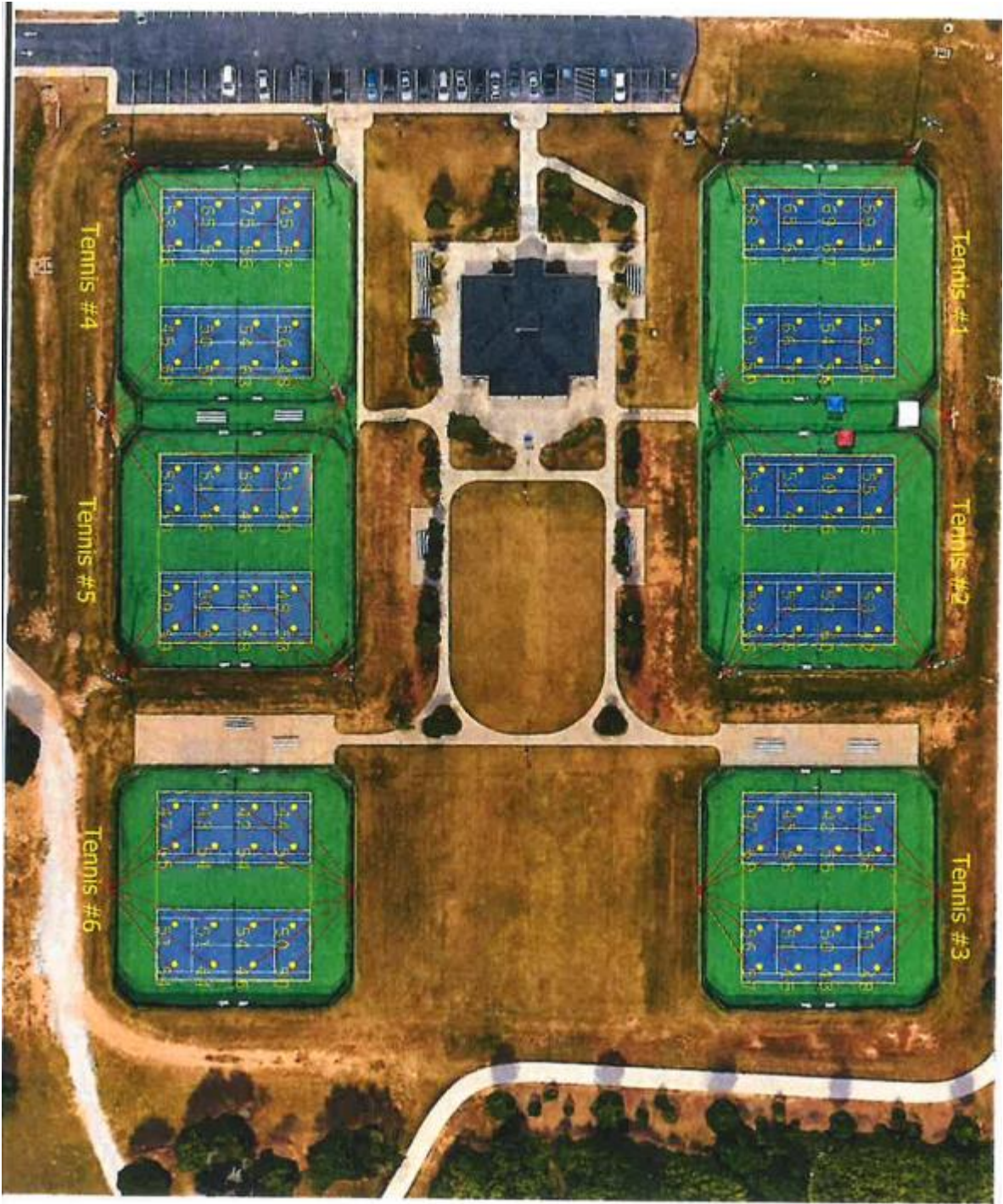
Rockdale Tennis Center, 1370 Parker Road SE, Conyers, GA 30094