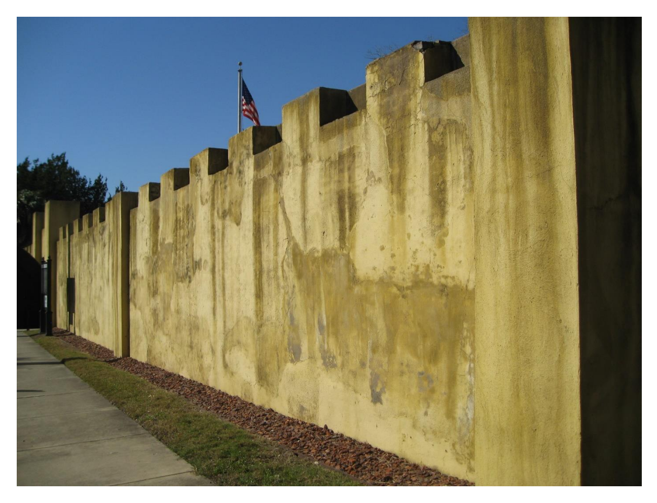
A7. South Outer Wall