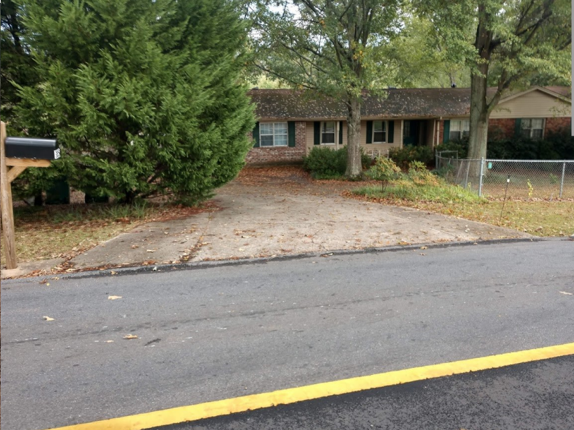
Remove and dispose of 9 driveway aprons and associated storm pipes and install 22x10x8" 3500 psi concrete aprons incorporated into new curb and gutter roadway (field verify exact width variations).