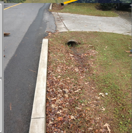
Install 80 linear feet of 18" HDPE stormwater pipe and remove existing headwall.