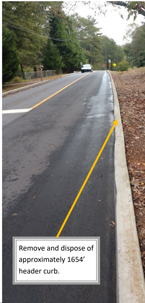
Remove and dispose of approximately 1654' header curb.