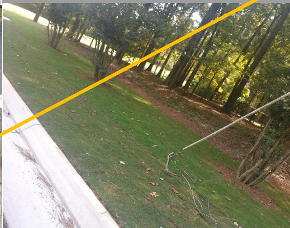
Backfill newly installed curb and gutter with suitable soils to grade and landscape to grass's currently on the property.