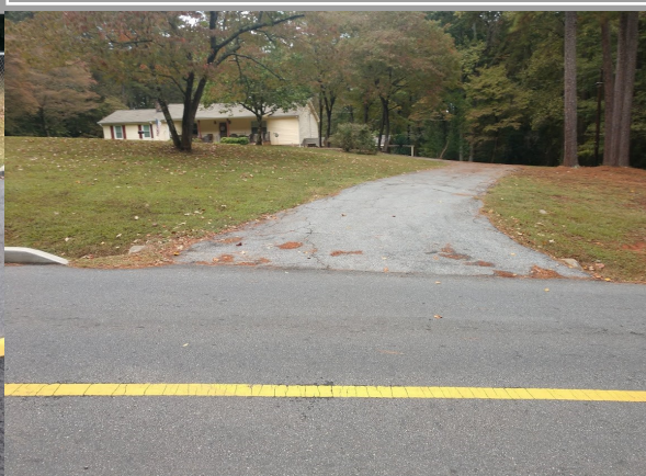
Install 80 linear feet of 18" HDPE stormwater pipe and remove existing head-wall.