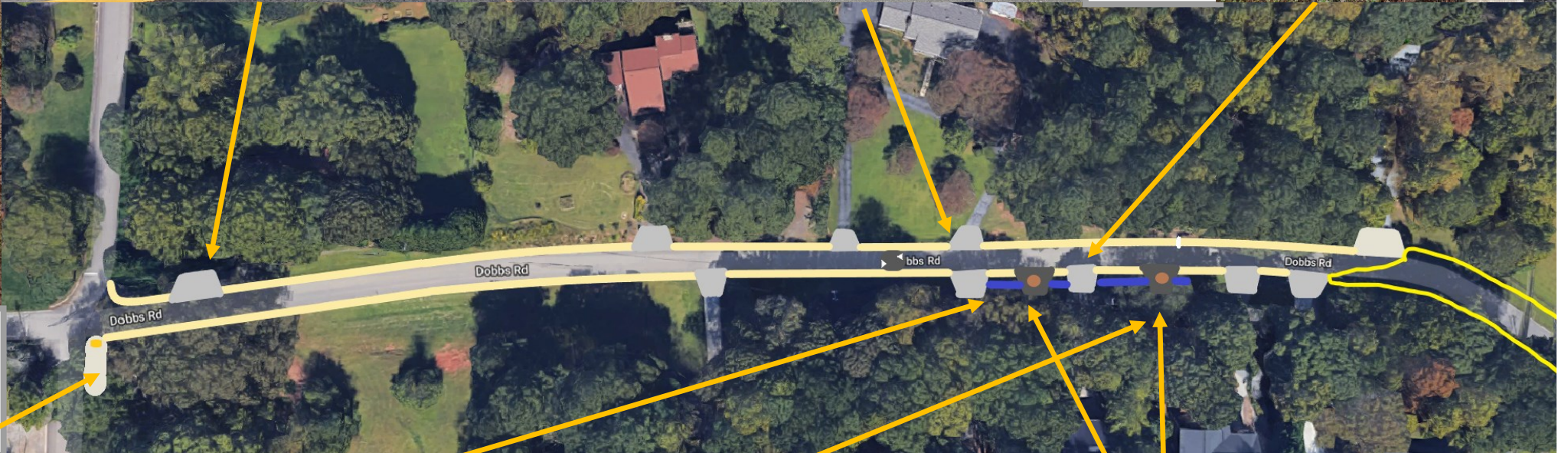
Grade and install approximately 1654' of two-foot 3500 psi concrete drivable surface 8" depth minimum on each side of the roadway with Type 7 curb and gutter.